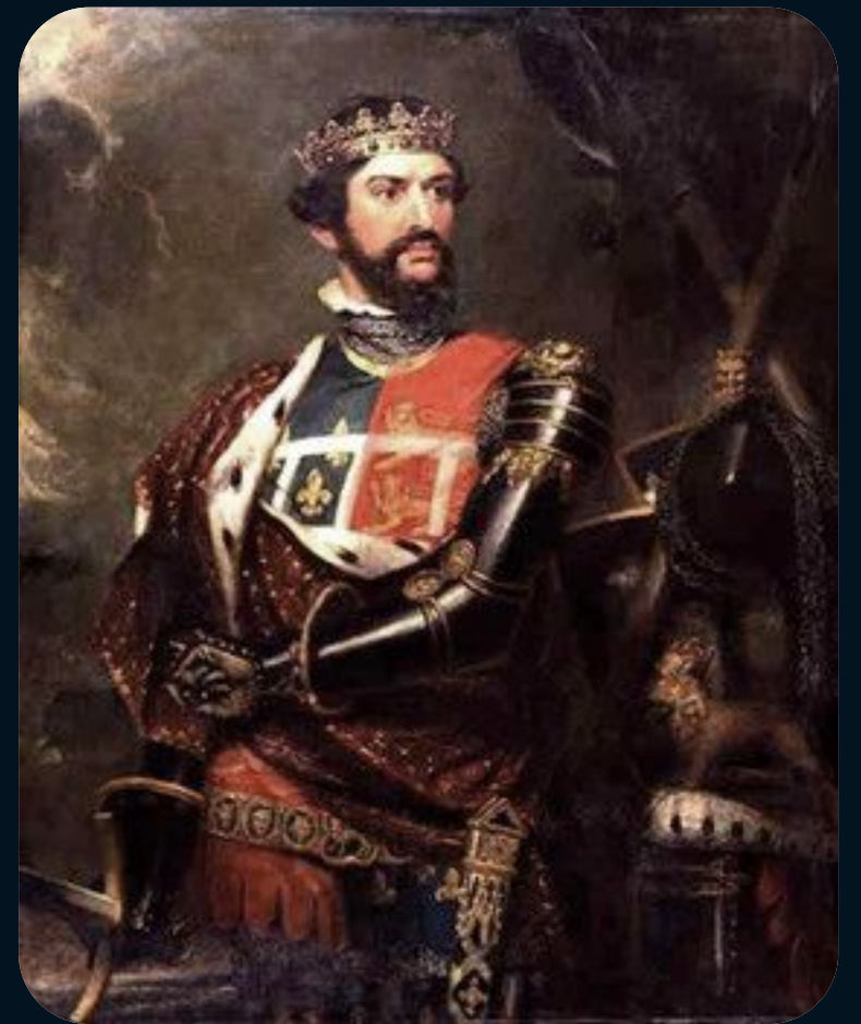
Edward the Black Prince