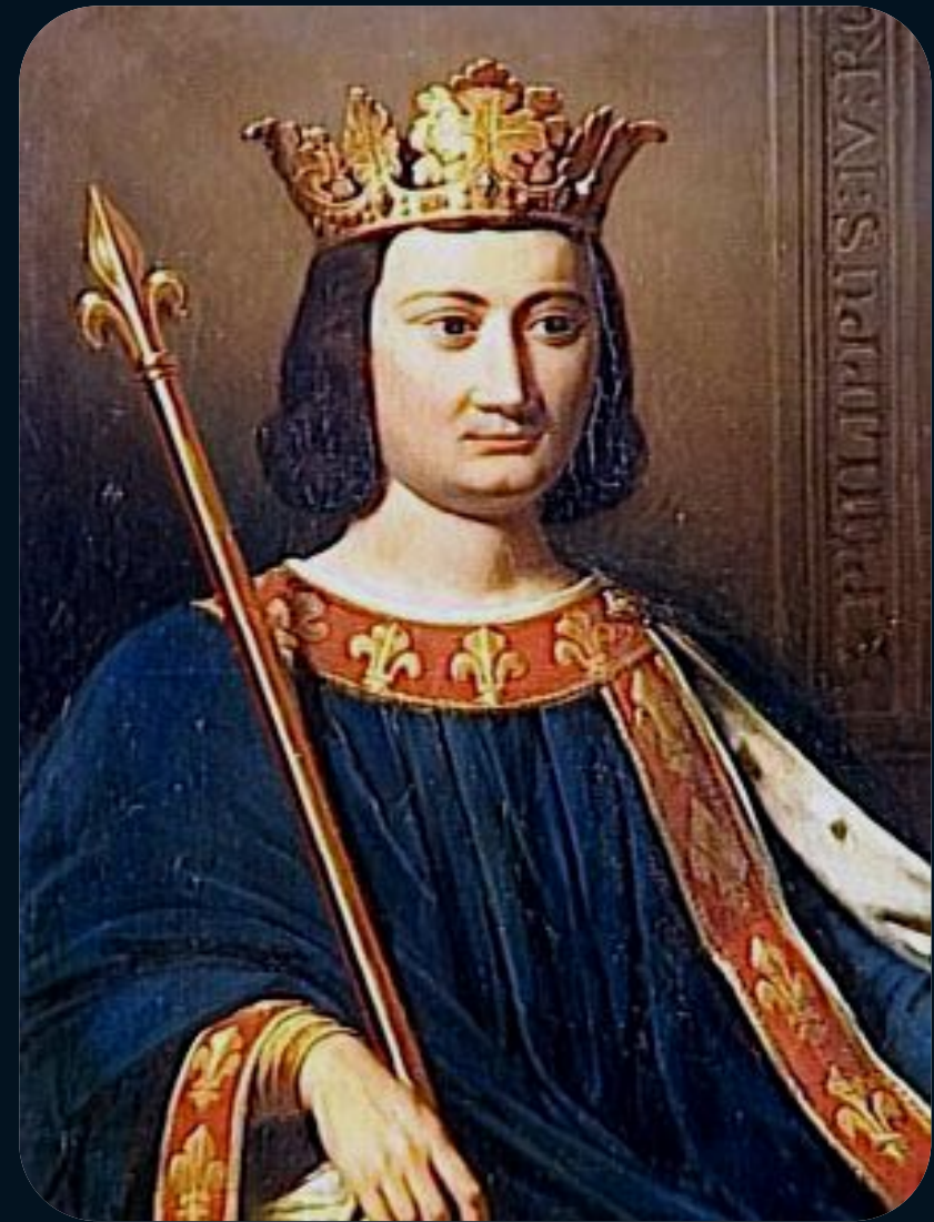
Philip of Valois

Crowned in 1328 the French King Philip of Valois (the founder of a new dynasty) confiscated Aquitaine, which was possession of England after his marriage in 1152 Henry II to Eleanor of Aquitaine. In response, Edward III invaded France in 1338, won the naval battle at Slëyse in 1340 and land battles of Crecy (1346) and Calais (1347). At the Battle of Poitiers (1356), his son Edward the Black Prince captured heir John Philip II. At the Treaty of Bretigny he was released for a ransom of 50 thousand. Pounds, and England received large areas in the south-west of France, giving up its claim to the crown.