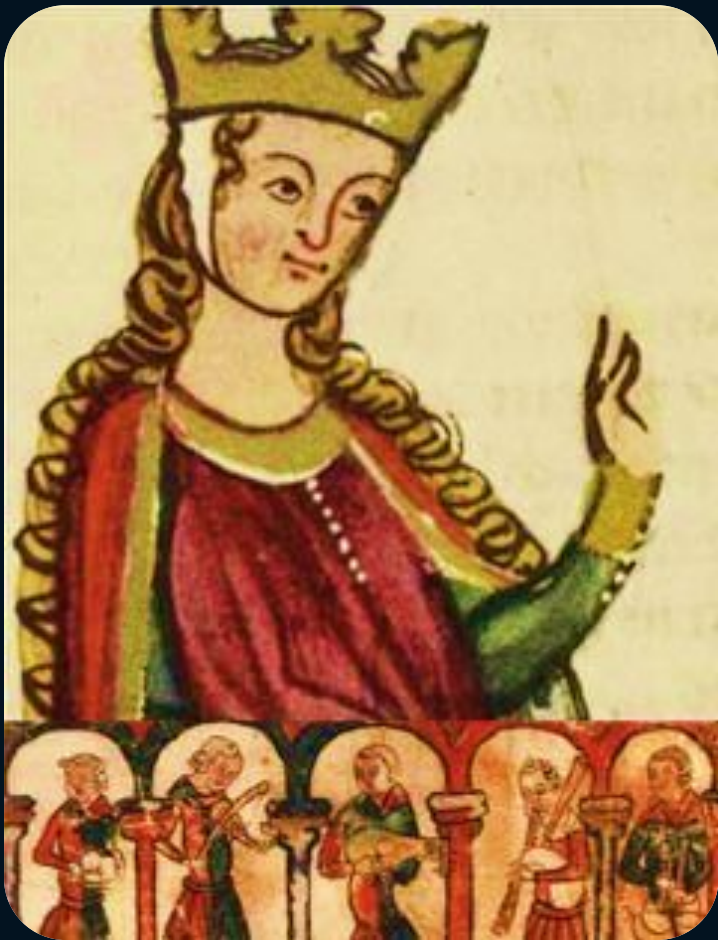
Eleanor of Aquitaine