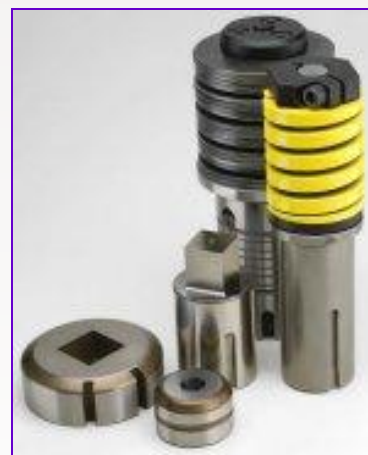
Thick Turret Style