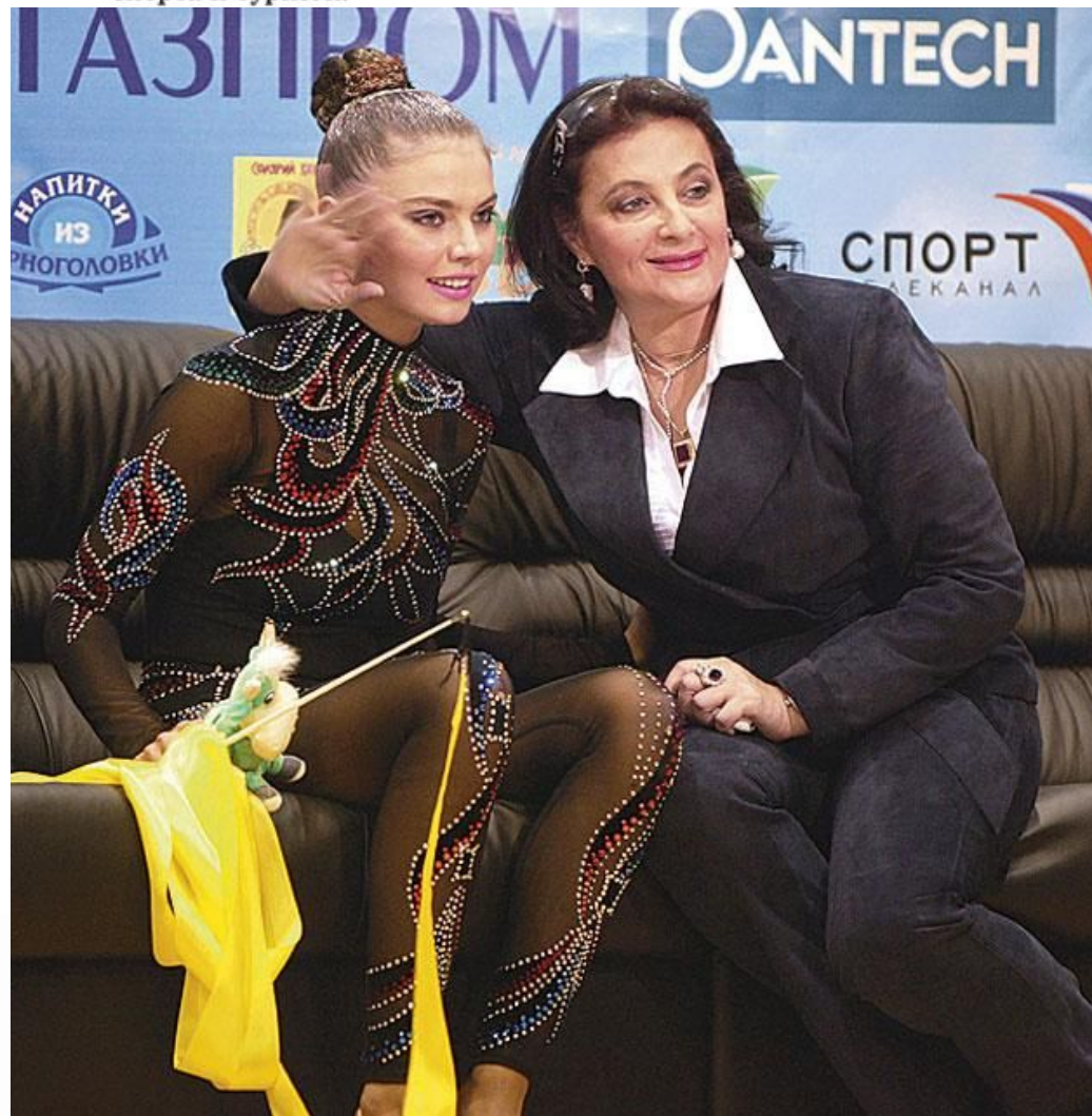
Alina Kabaeva and Irina Viner, 2004

Поволжская государственная академия физической культуры, спорта и туризма