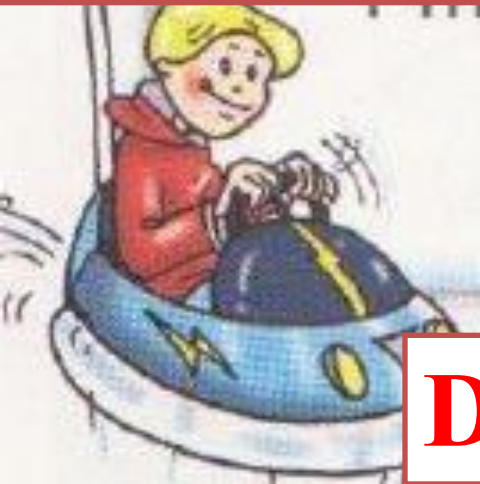
Drive a car