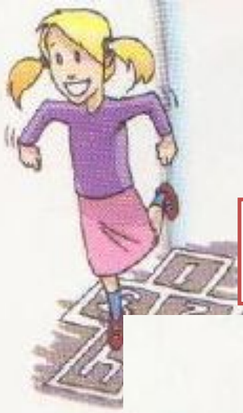
Play a game