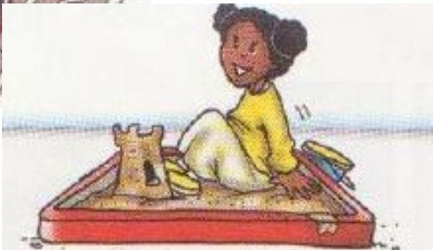
Make a sandcastle