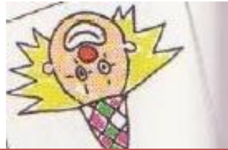
Face of a clown