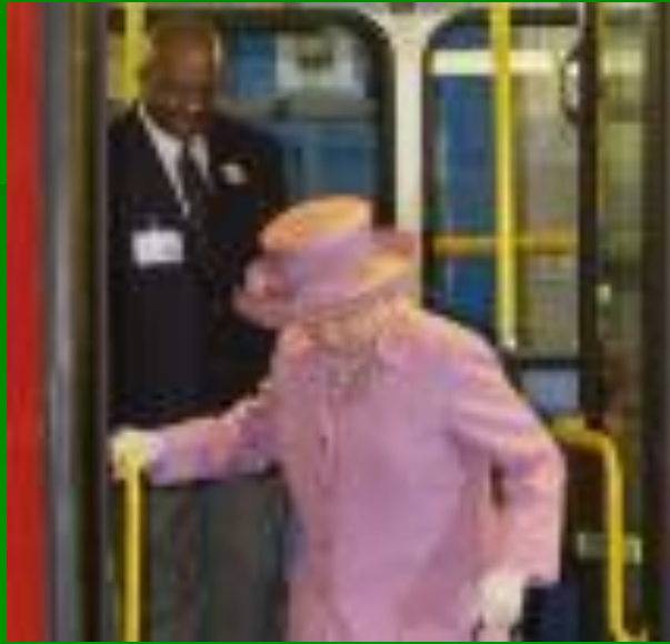
The Queen on a double-decker bus