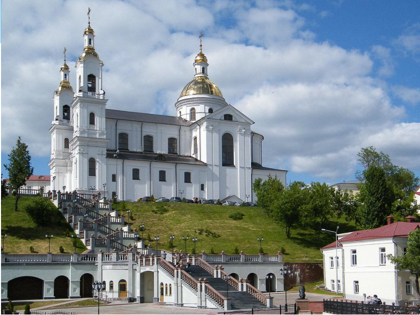
HOLY ASSUMPTION CATHEDRAL