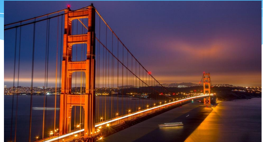
THE GOLDEN GATE BRIDGE