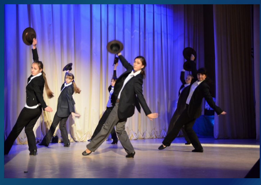
Performance of the dance team

At the faculty there are two organizations of student government: trade Union of students and student activists of the faculty.