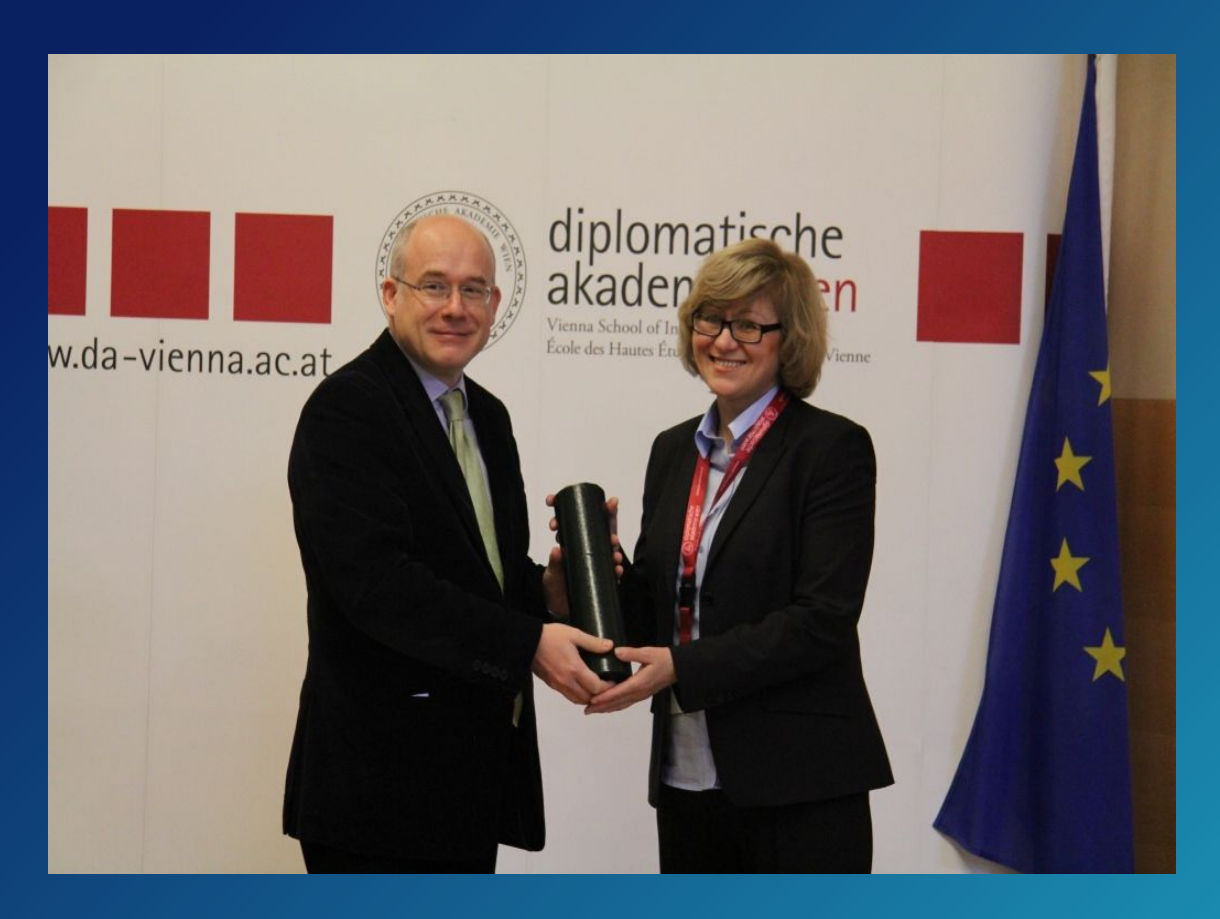
Diplomatic Academy in Vienna

The faculty cooperates with leading Universities of the Russian Federation: Moscow State Institute of international relations, University of the Ministry of foreign Affairs of the Russian Federation, Pedagogical University in Moscow, Saint-Petersburg State University, Nizhny Novgorod State linguistic University named after N.. Koroleva and etc.