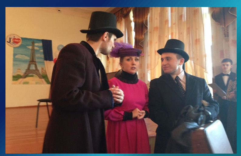
Festival of the French language