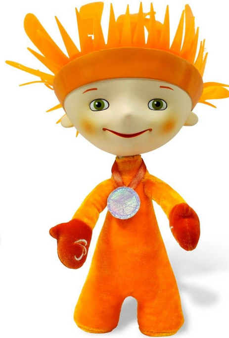
Ray of Light