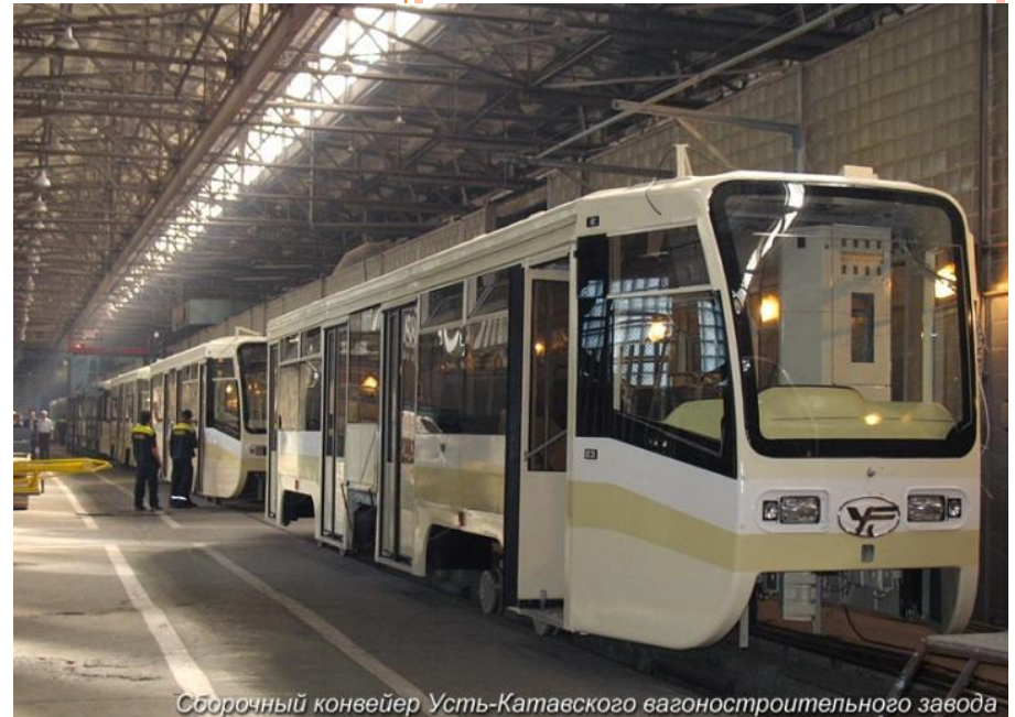
Сборочный конвейер Усть-Катавского вагоностроительного завода