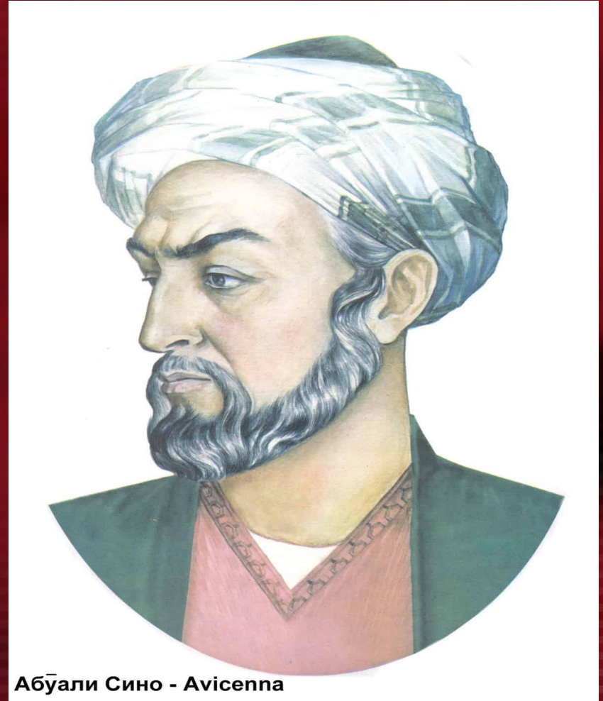
Абу́али Сино - Avicenna