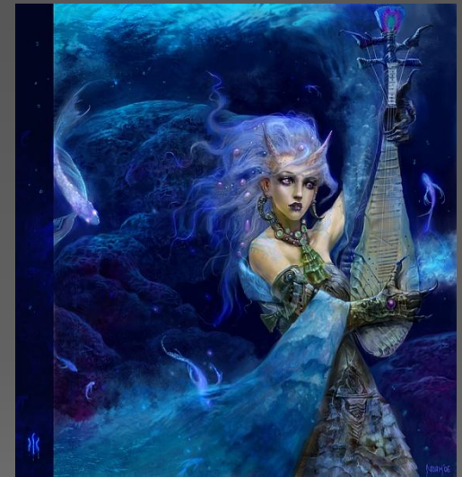
And his mother (the water-witch)