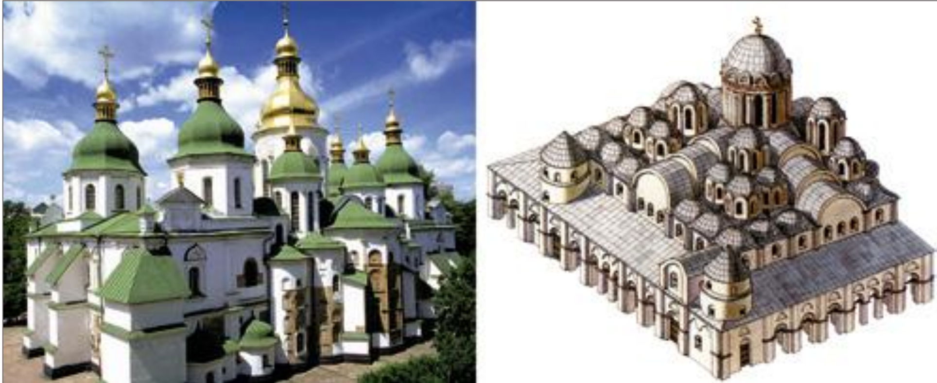
Saint Sophia's Cathedral, Kiev