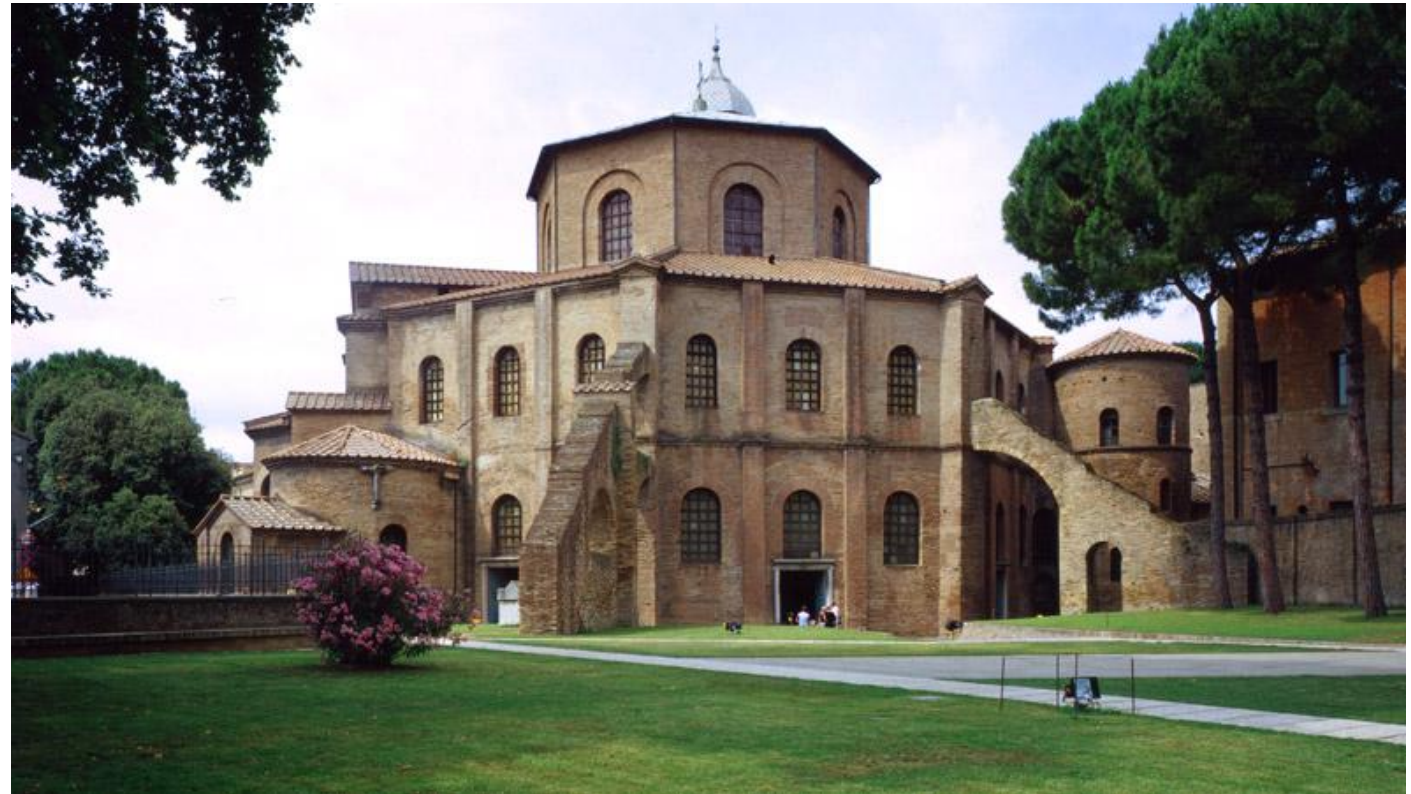
The Basilica of San Vitale, built in 548