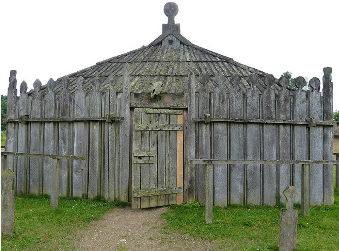
A Slavic sanctuary, reconstructed