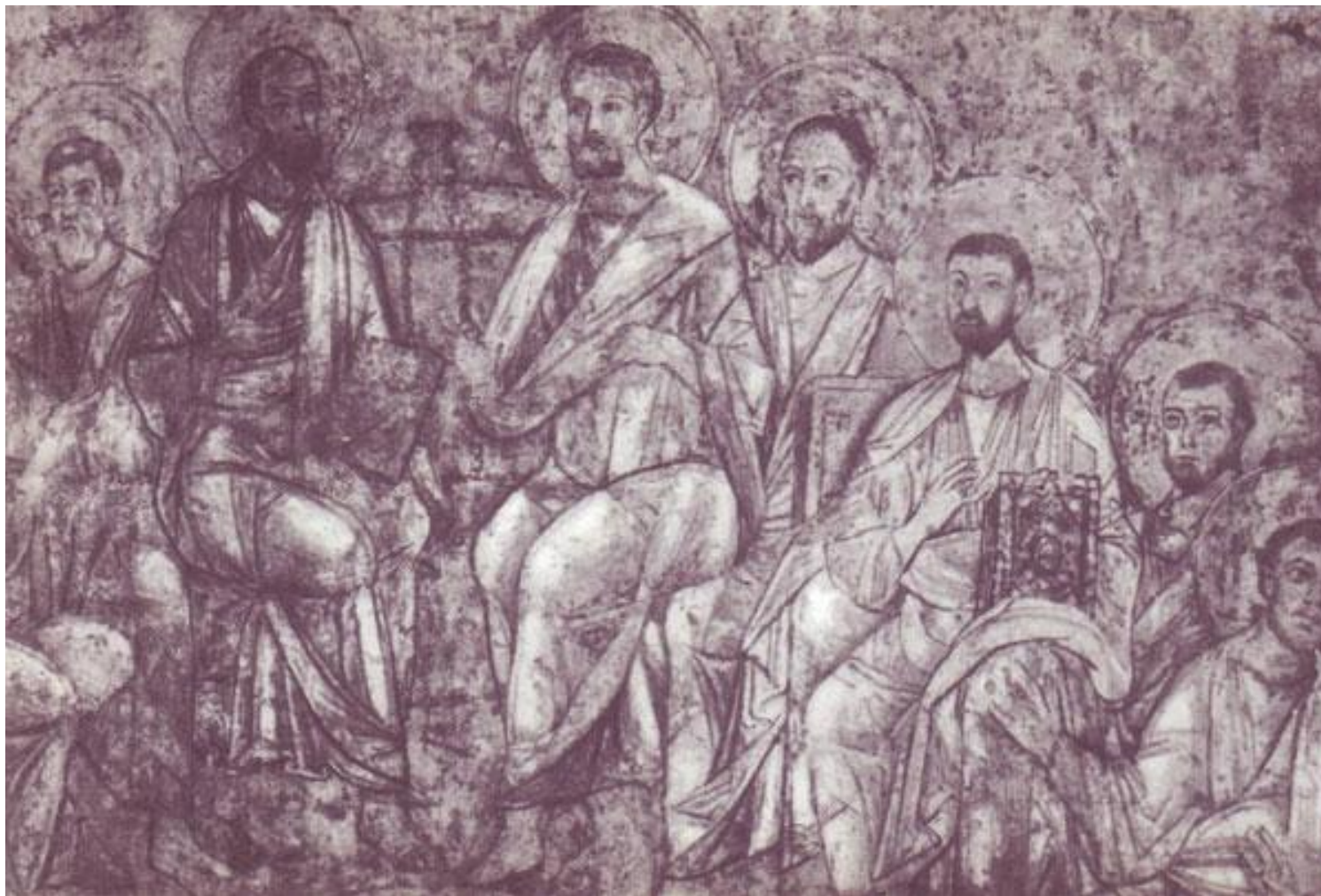
Fresco "The Descent of the Holy Spirit"