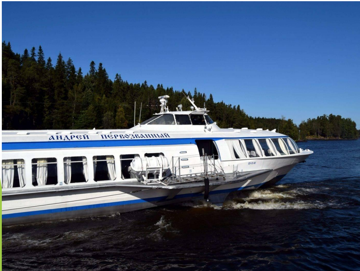
METEOR water transport