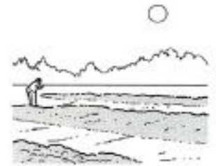
3 dried in sun (4 weeks)