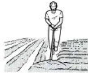
4 raked and turned