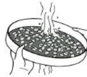
2 cleaned (sieve)