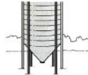
5 stored in silo