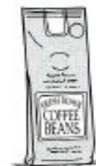
12 packed and sold