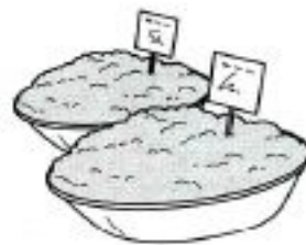
10 coffee sold