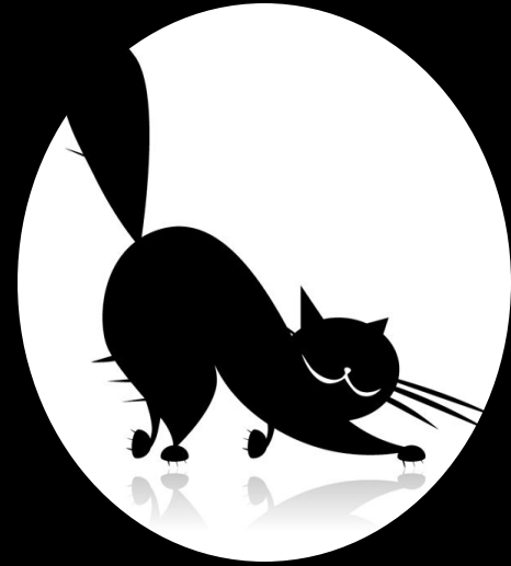
◦ Black cat