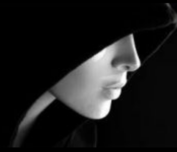
◦ White Lady