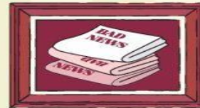
2 Bad news comes in threes