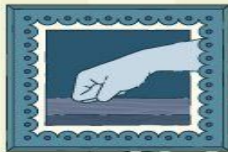
2 Knock on wood