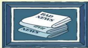
4 Bad news comes in threes