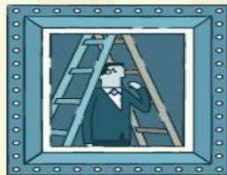
6 Don't walk under a ladder