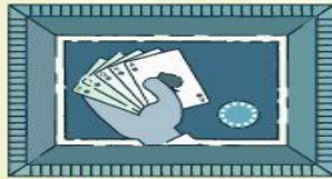
1 Beginner's luck