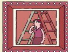
9 Don't walk under a ladder