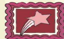
4 Wish on a star