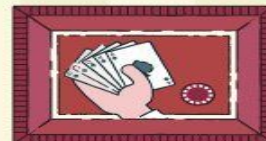
7 Beginner's luck