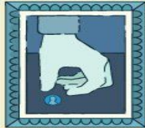
3 Find a penny, pick it up ...