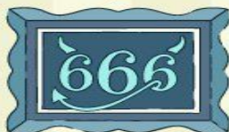
7 The number 666