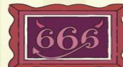
10 The number 666