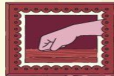
1 Knock on wood