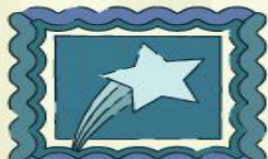
9 Wish on a star