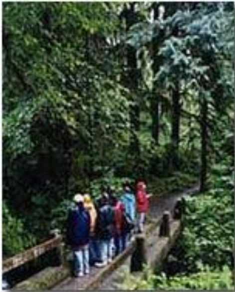
Group dwarfed by trees in Quinault Rainforest