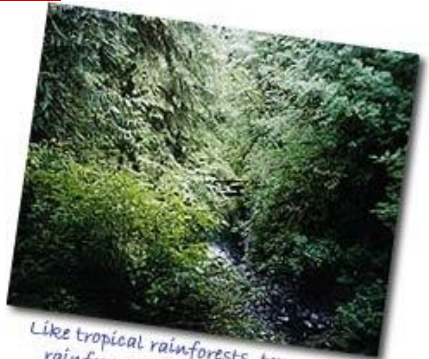
Like tropical rainforests, temperate rainforests are lush and green!