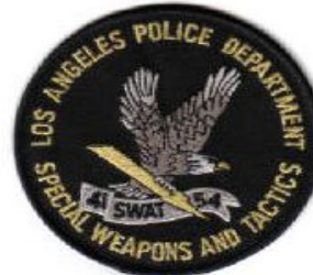
LAPD SWAT 49/51