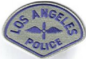
LAPD Air Support Division