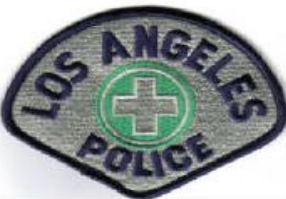
LAPD Traffic Division