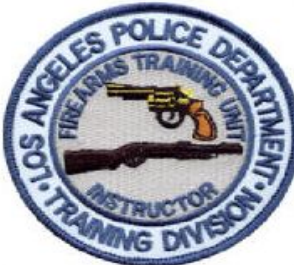
LAPD Training Division-Firearms Training Unit