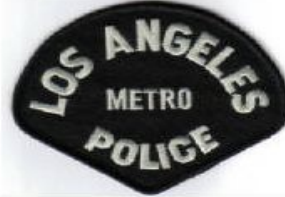
LAPD Metropolitan Division