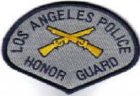
LAPD Honor Guard