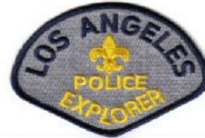
LAPD Police Explorer