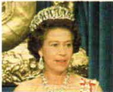
Queen Elizabeth II

Do you know who any of these people are? How can they be related to English banknotes? Read to find out.