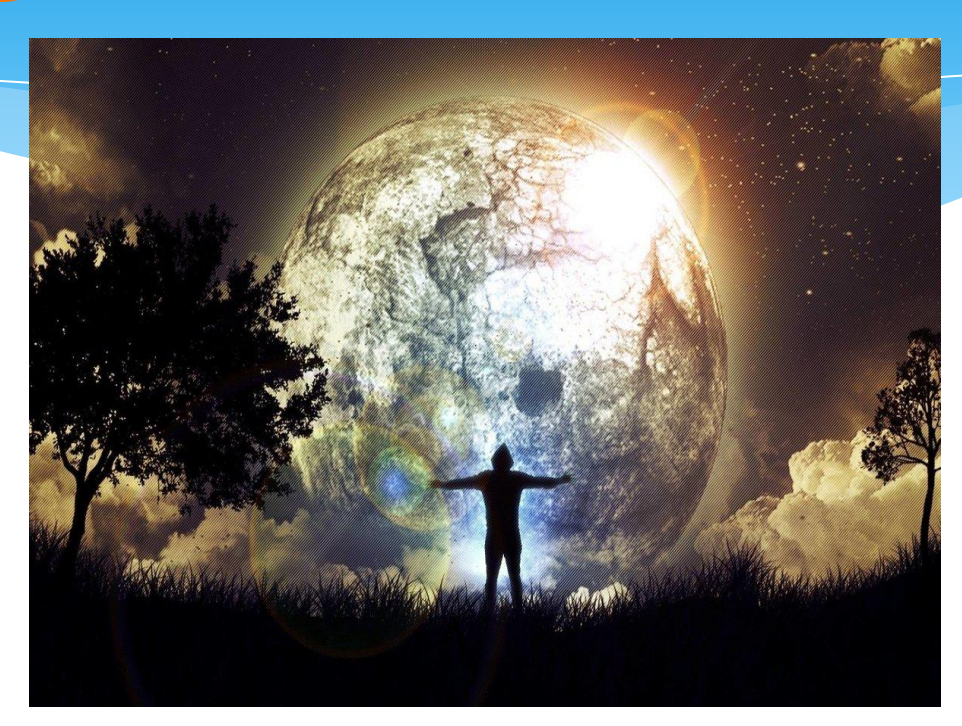
LIFE IS THE MOST IMPORTANT THING