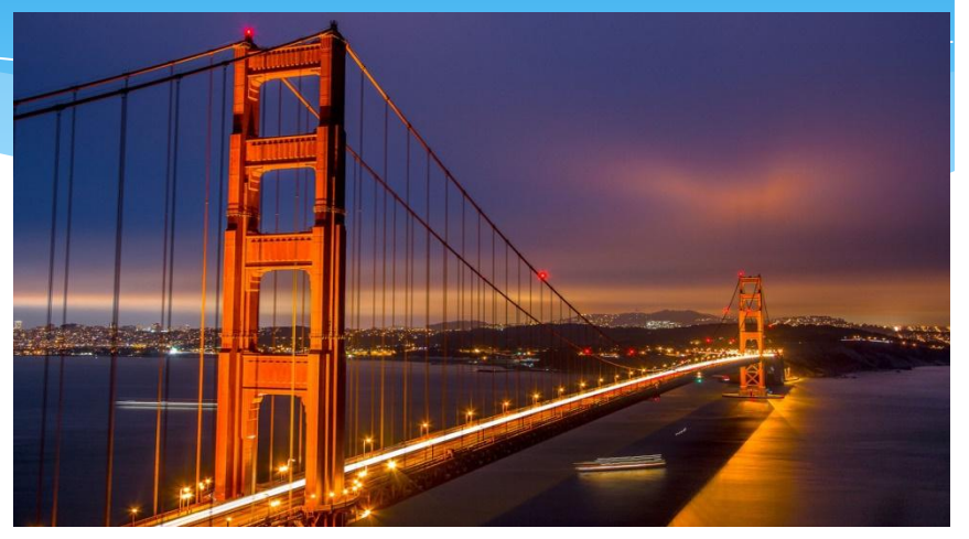
THE GOLDEN GATE BRIDGE