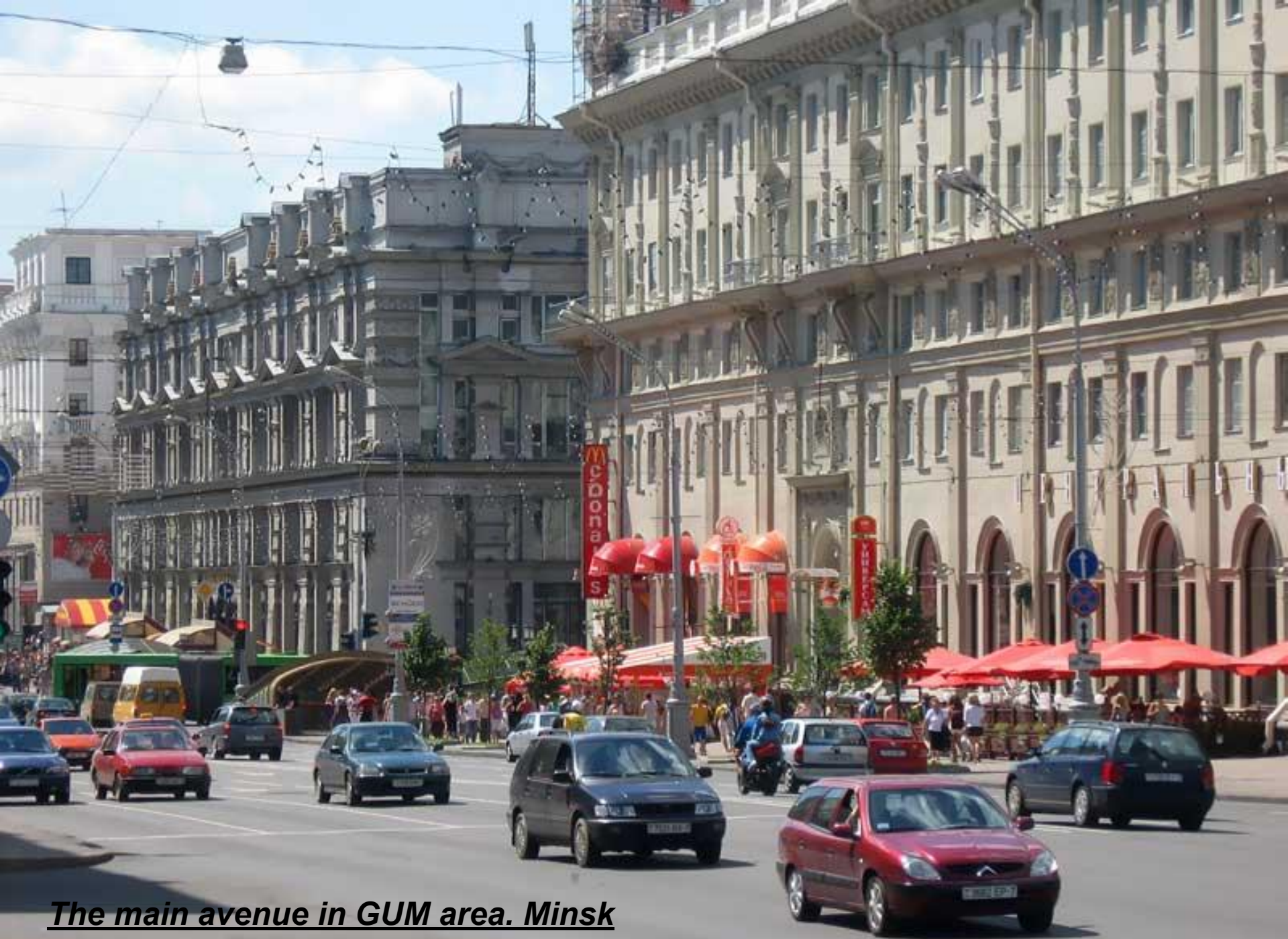
The main avenue in GUM area. Minsk