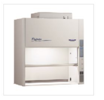
Basic 47 Fume Hood with Built In Blower Module, 115V, 60Hz