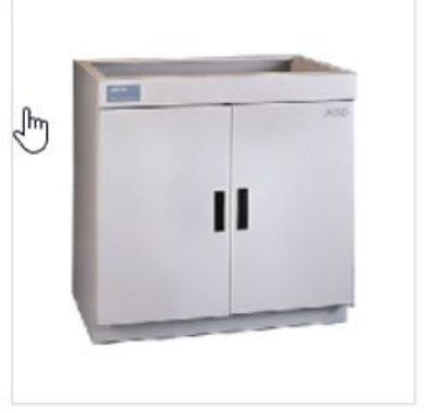
Protector Acid Storage Cabinet, 36.75" x 30" x 22", manual close