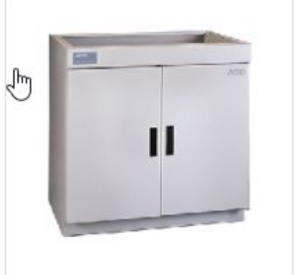
Protector Acid Storage Cabinet, 36.75" x 30" x 22", manual close