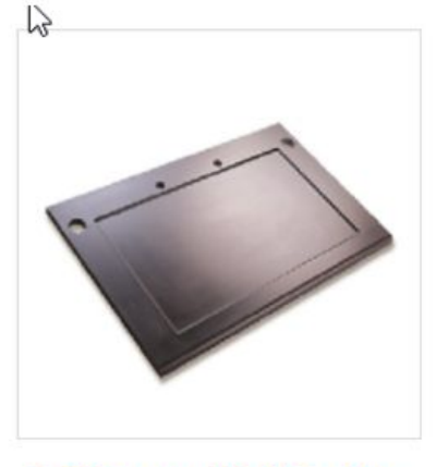
SpillStopper Work Surface, 60" x 31.7", Black Epoxy Resin