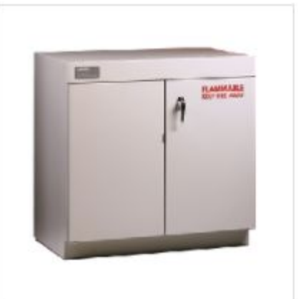
Protector Solvent Storage Cabinet, 36.75" x 36" x 22", self close