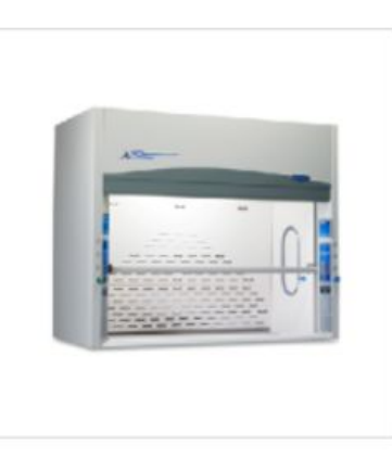
96" Protector XStream Laboratory Fume Hood, 110-115V, 50/60 Hz