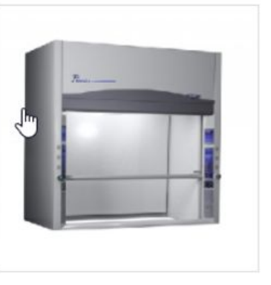
60" Protector Premier Laboratory Fume Hood, 110-115V, 50/60 Hz