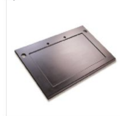
SpillStopper Work Surface, 60" x 31.7", Black Epoxy Resin