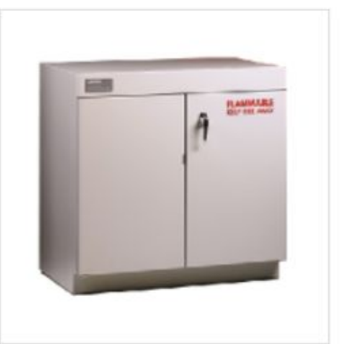
Protector Solvent Storage Cabinet, 36.75" x 36" x 22", self close