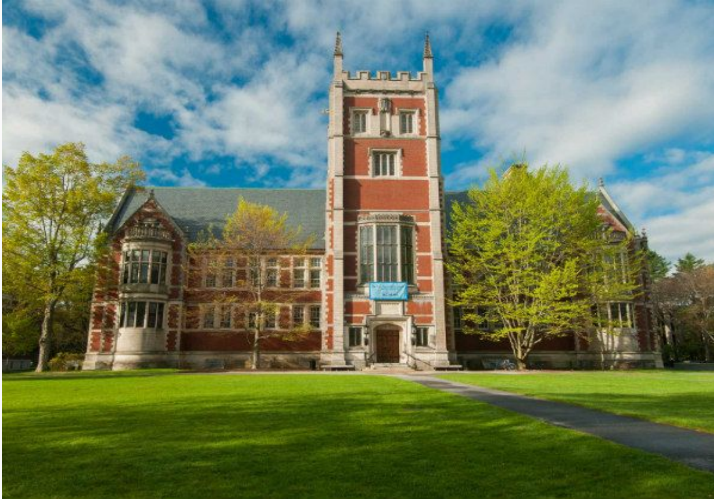
BOWDOIN ART COLLEGE