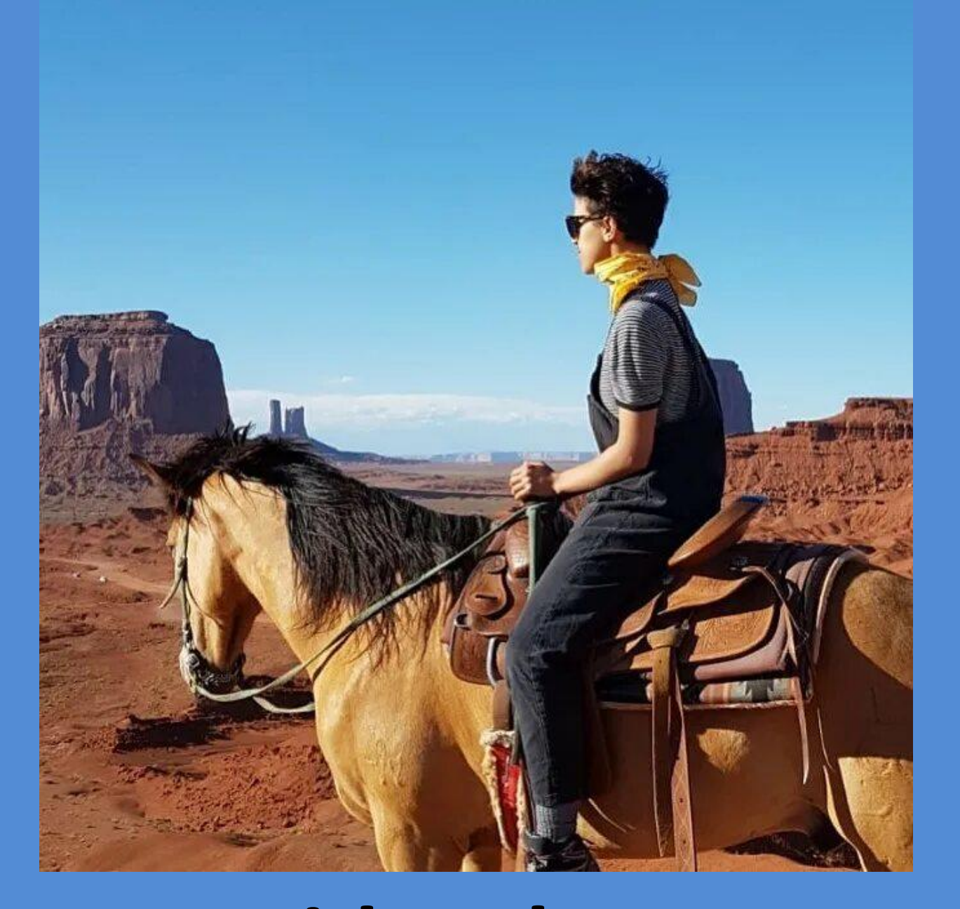
ride a horse