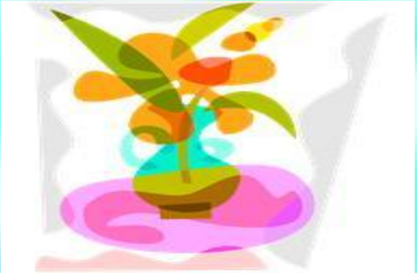
VASE OF FLOWERS