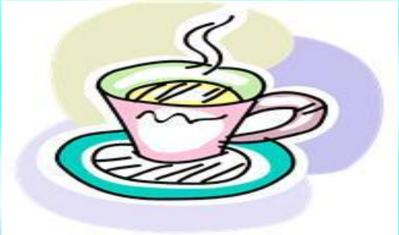
CUP & SAUCER