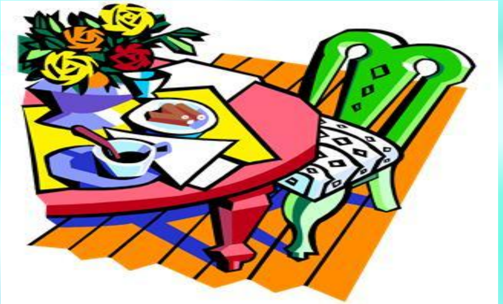
TABLE & CHAIR