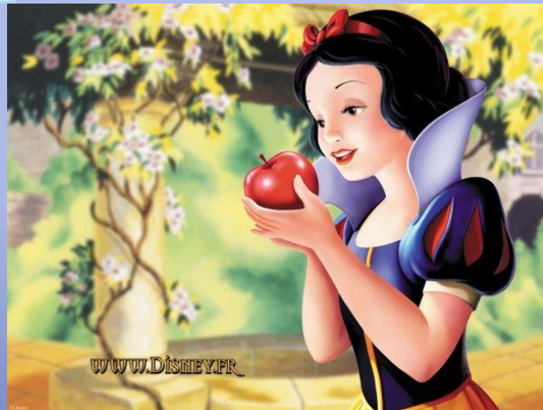
The Snow White and the seven Dwarfs