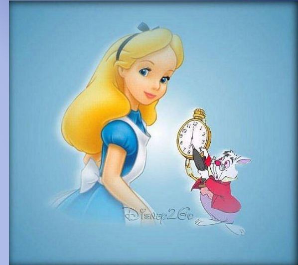
Alice's in the Wonderland