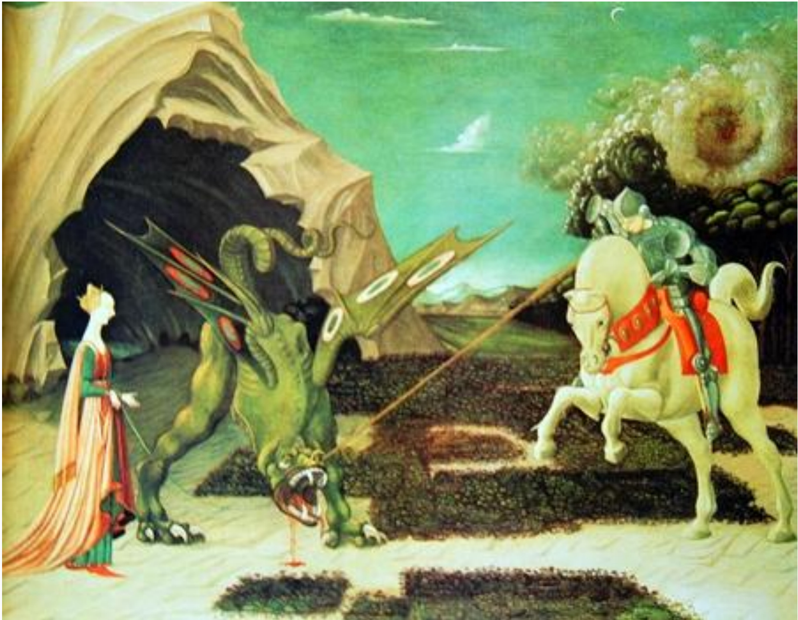
Paolo Uccello: St George and the Dragon , 1470.