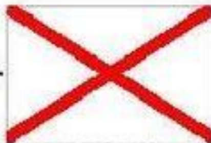
Cross of St. Patrick (Ireland)