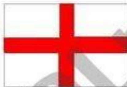
Cross of St. George (England)

The flag of the UK is a combination of the flags of England (the cross of St. George), Scotland (the cross of St. Andrew), and Ireland (the cross of St. Patrick).