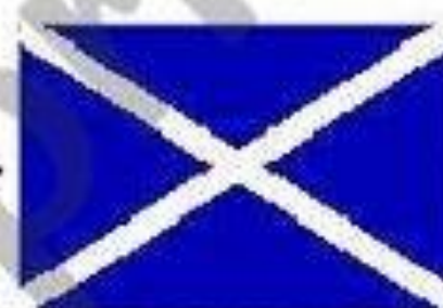
Cross of St. Andrew (Scotland)