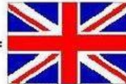
Union Jack (United Kingdom)