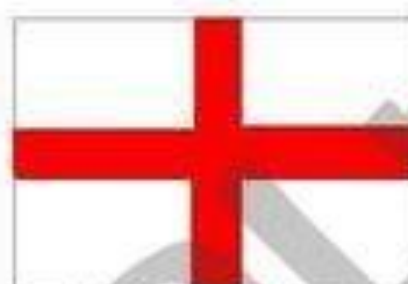
Cross of St. George (England)

The flag of the UK is a combination of the flags of England (the cross of St. George), Scotland (the cross of St. Andrew), and Ireland (the cross of St. Patrick).