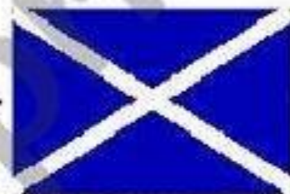
Cross of St. Andrew (Scotland)