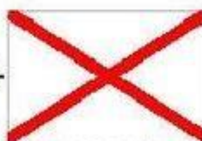
Cross of St. Patrick (Ireland)