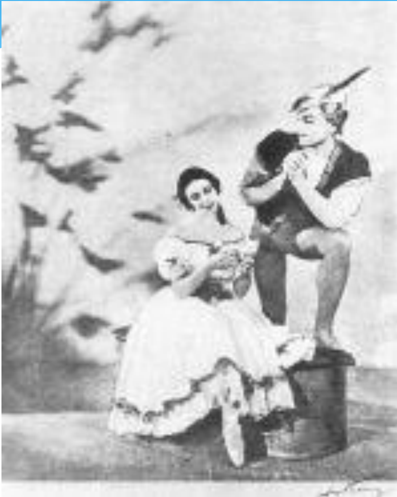
"The Creatures of Prometheus"

In Vienna, he wrote 28 sonatas, ballet "The Creatures of Prometheus", First and Second Symphony.