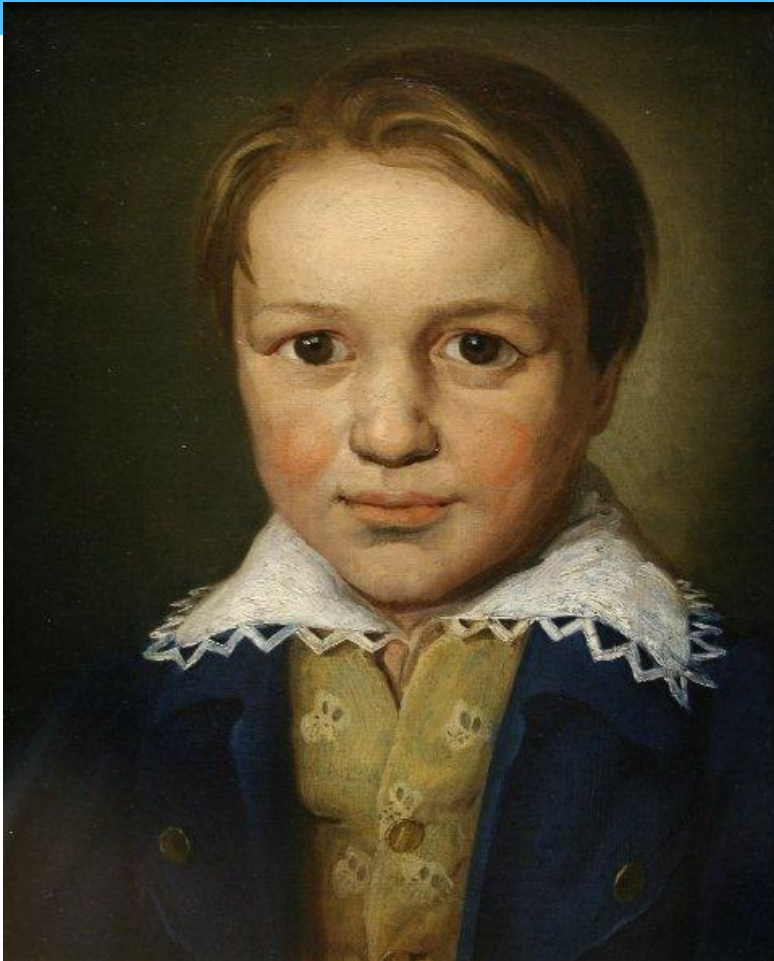
Ludwig van Beethoven

In twelve years, he worked as an assistant court organist. In 1787 Beethoven visited Vienna and Mozart.