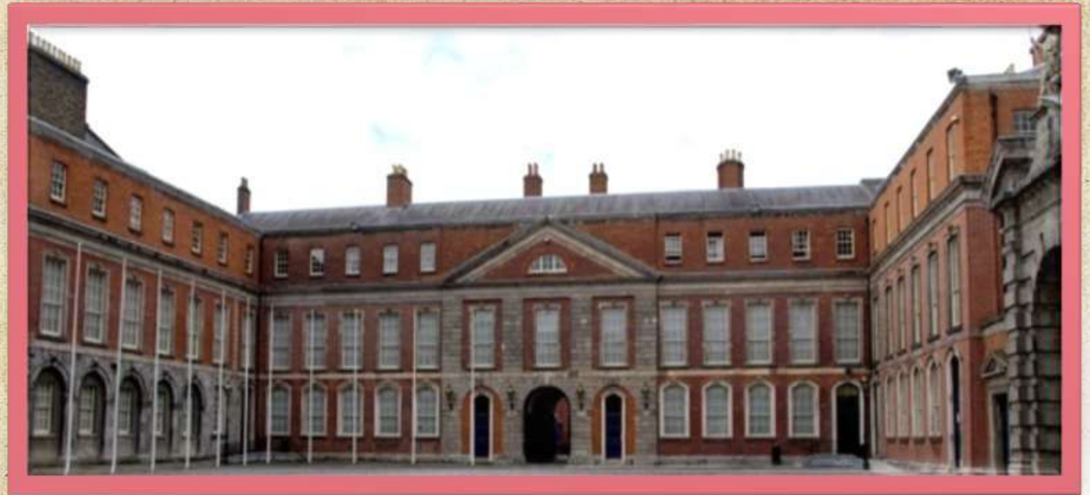
Dublin Trinity College

Oscar Wilde from 12 years old wore a top hat and knew how to charm anyone that speak with him. Contemporaries recalled that his conversations were full of witty aphorisms as his plays. In life and literature, he chose the role of the great esthete for himself, he even spoke in public not in his own voice, but imitated the voice of Sarah Bernard.