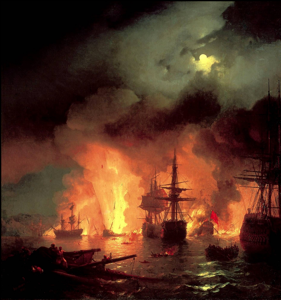
Chesmensey fight (1848)