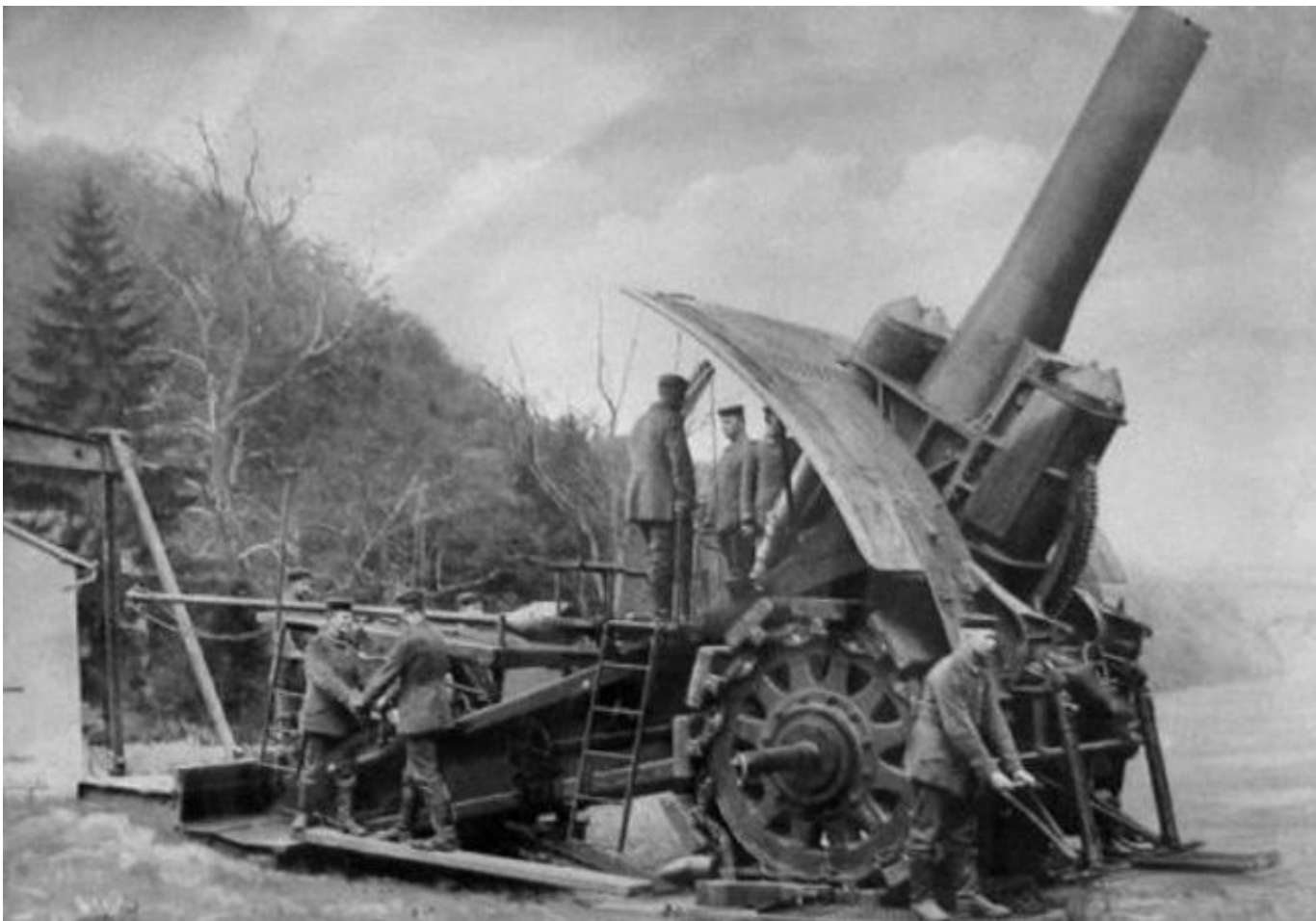
Гаубица «Большая Берта» (Германия) Выстрелы в Бельгии слышно на английском побережье