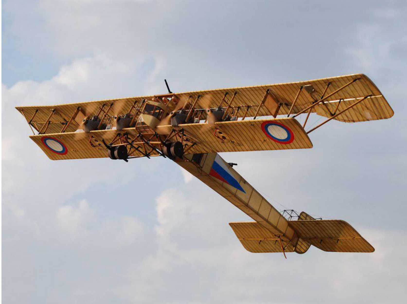
Бомбардировщик «Илья Муромец»