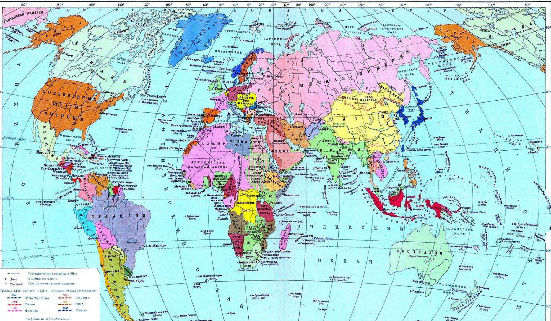
МАСШТАБ: 1:90 000 000

Примечания: 1. Французская Западная Африка включала: Верхний Сенегал — Нигер, Мавританию, Французскую Гвинею, Дагомею, Берег Слоновой Кости, Сенегал. 2. Французская Экваториальная Африка включала: Габон, Среднее Конго, Убанги-Шари, Чад. 3. Французский Индокитай включал: Камбоджу, Кочинскую, Лаос, Аннам, Тонкин. 4. Колониальные государства и их владения даны на карте одним цветом.