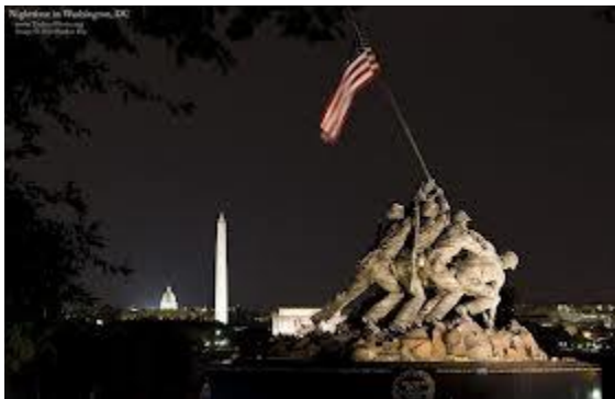
The Marine Corps War Memorial