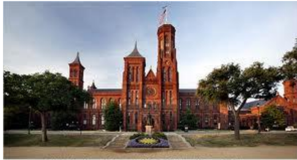
The Castle, the main information building of the Smithsonian Institution, Photo Terry O'Connell/The New York Times