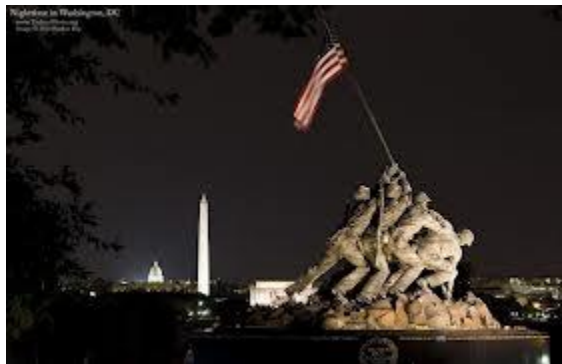
The Marine Corps War Memorial