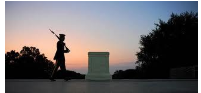
Arlington National Cemetery