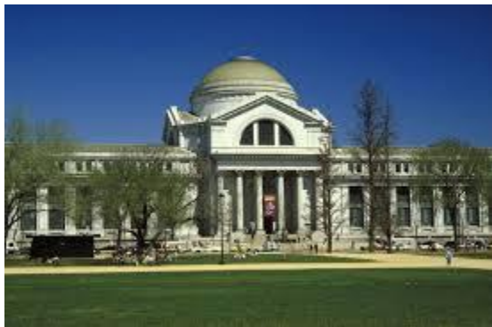
National Museum of Natural History