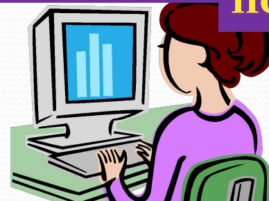
computer programmer, office worker