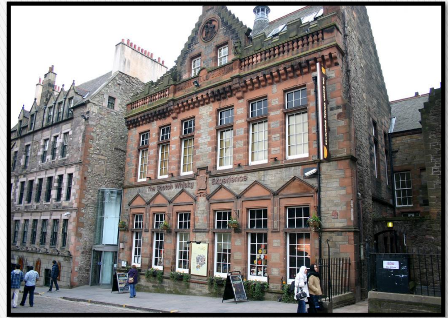
Scottish Whiskey Heritage Center