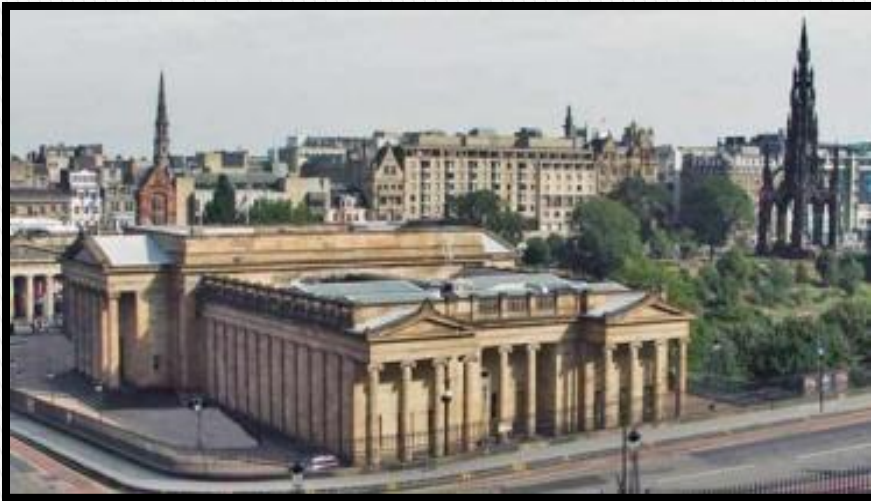
Scottish National Gallery