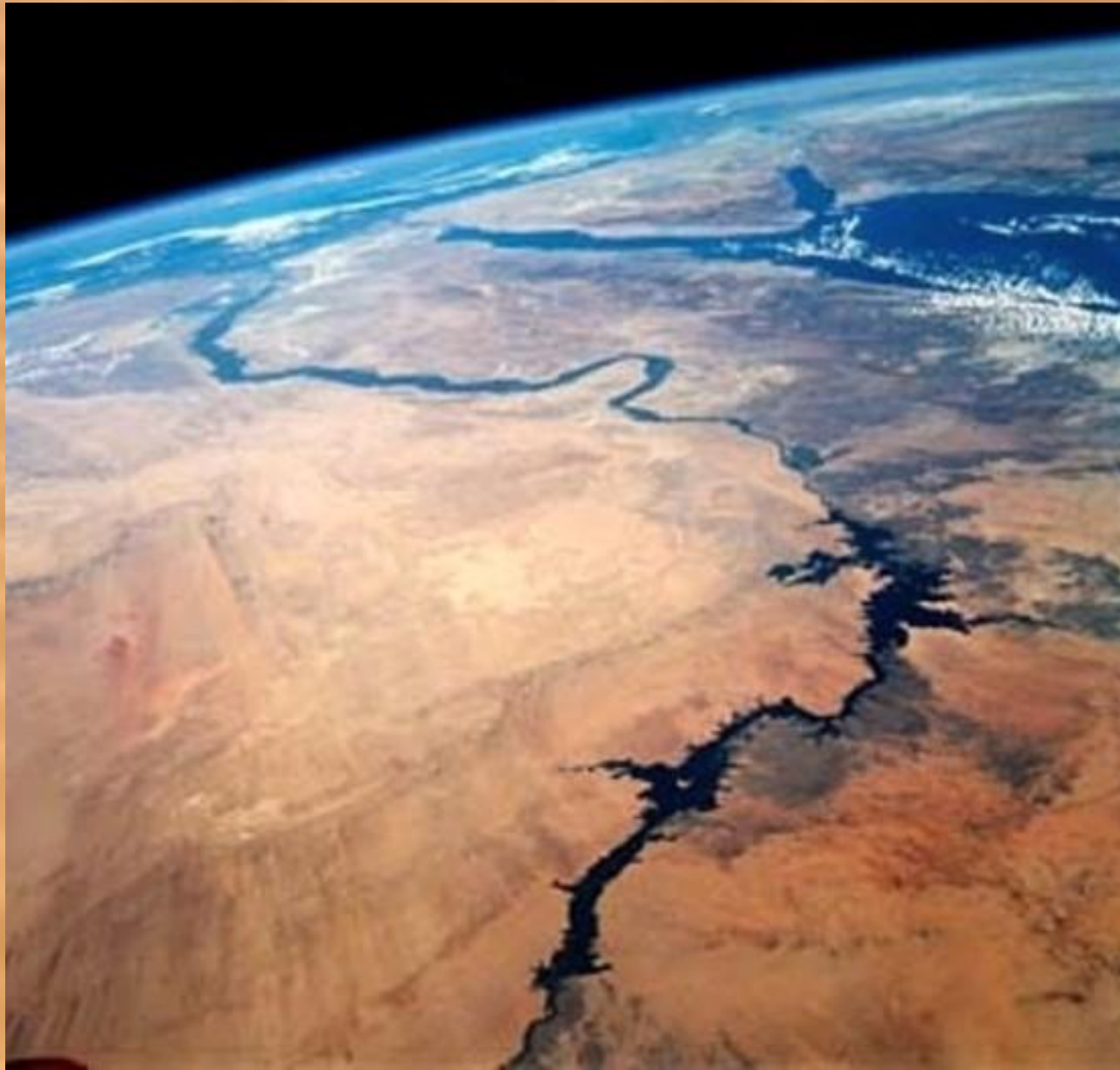
The Nile river from space. It is the longest river in the world at 6853 km.