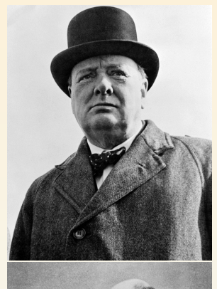
1. Sir Winson Churchill (1874 – 1965)