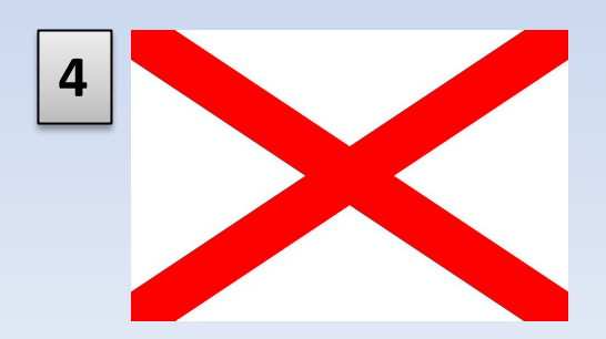
Northern Ireland (The cross of St. Patrick)