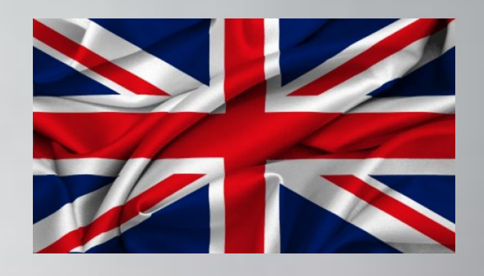
The flag of Great Britain