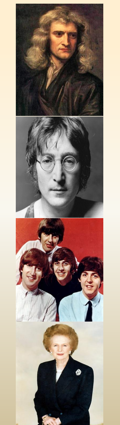
4. Isaac Newton (1643 – 1727)

☐ Was an English physicist and mathematician