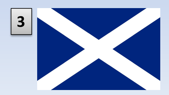
Scotland (The cross of St. Andrew)