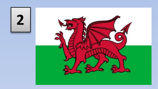
Wales (A red dragon passant on a green and white field)