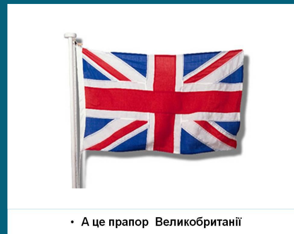
• А це прапор Великобританії