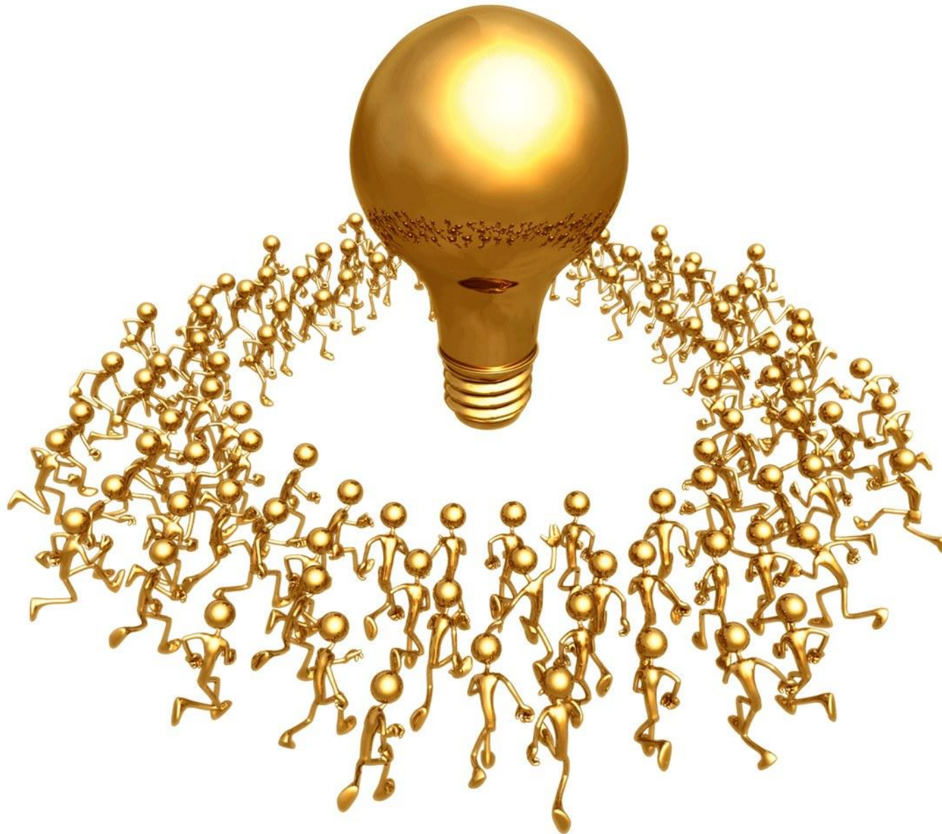
Figure 9.3