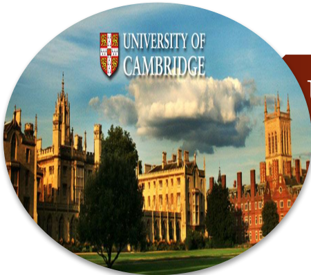
University of Cambridge – England, founded 1209