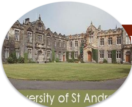
University of St Andrews – Scotland, founded 1413