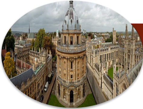
University of Oxford – England, founded 1096