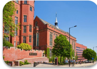
Red Brick Universities