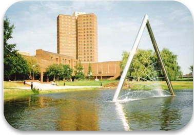
Plate Glass Universities