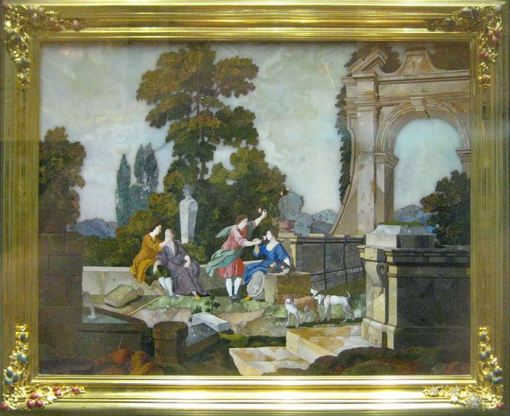
Mosaic Picture "Touch and Smell". Italy, 1751.