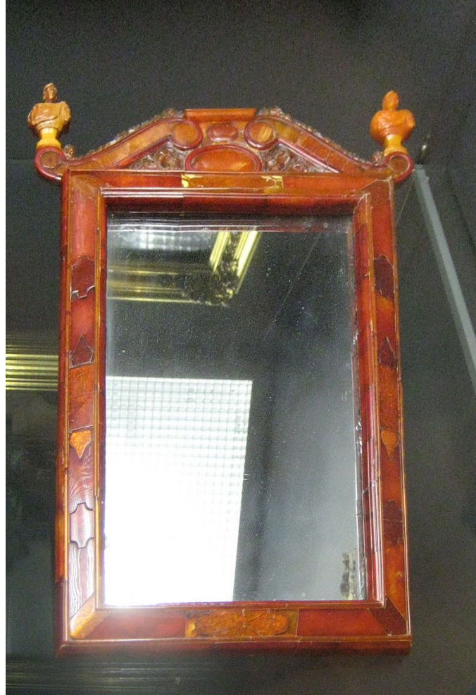
Mirror. It was donated by Friedrich Wilhelm I to Peter the great during his stay in Berlin in 1716.