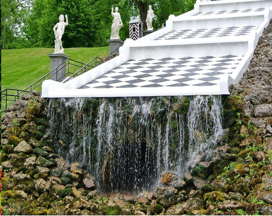
Cascade "Chess mountain"