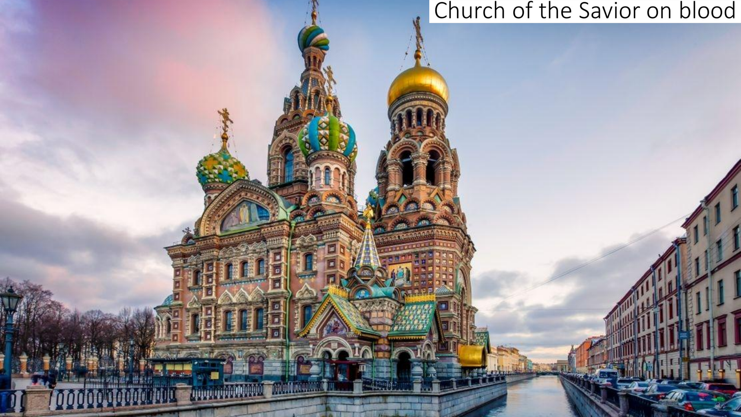
Church of the Savior on blood