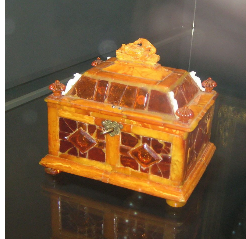
Casket. It was presented by Friedrich Wilhelm I to Peter the great during his stay in Berlin in 1716.