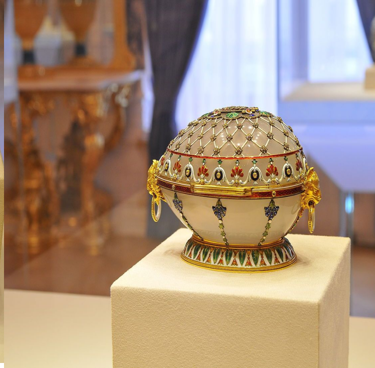
Imperial Easter egg-box "Renaissance" from the collection of the Faberge Museum in St. Petersburg.