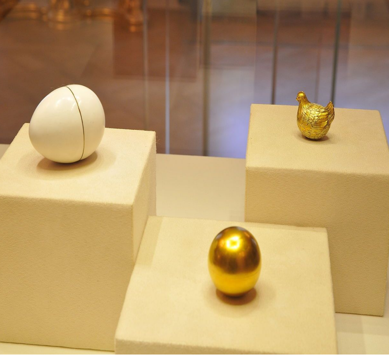
Imperial Easter egg "chicken" from the collection of the Faberge Museum in St. Petersburg.