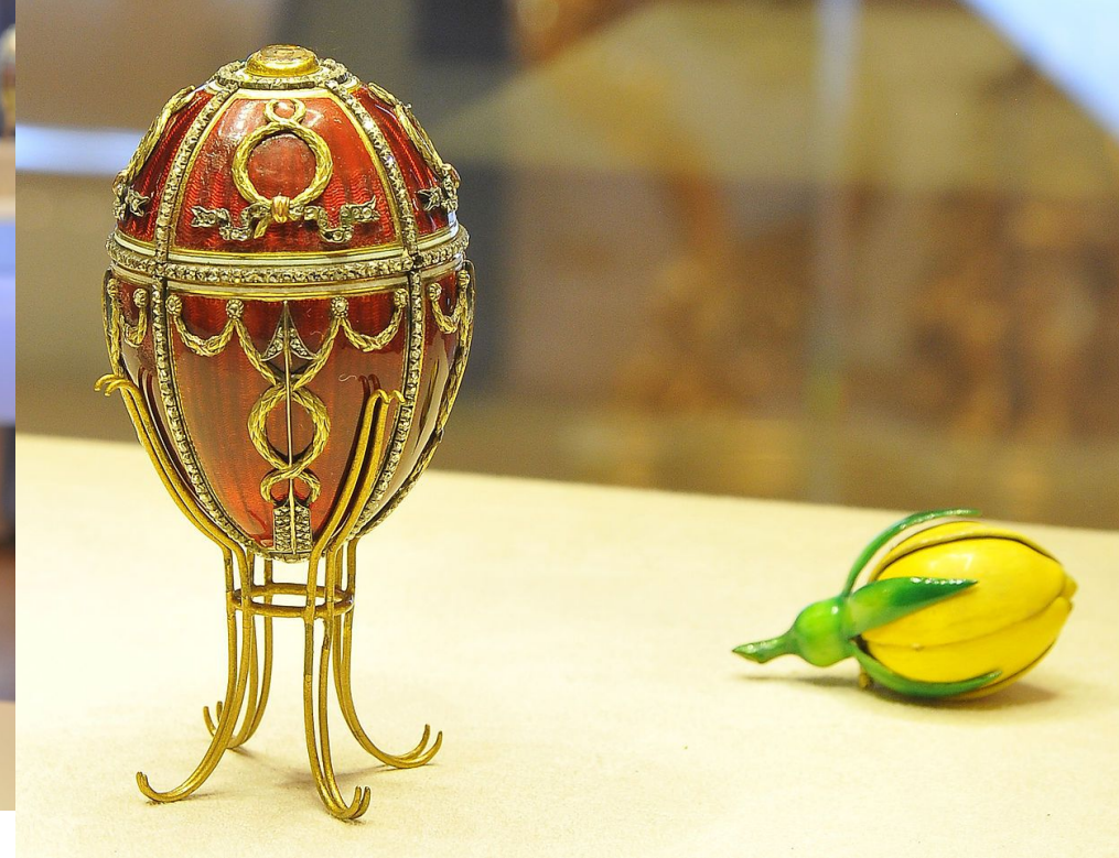
Imperial Easter egg "Rosebud" from the collection of the Faberge Museum in St. Petersburg.