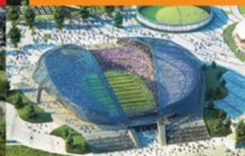
FIFA WORLD CUP™ STADIUM SOCHI