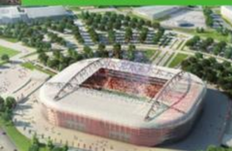
SPARTAK STADIUM // MOSCOW