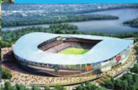
FIFA WORLD CUP™ STADIUM KAZAN