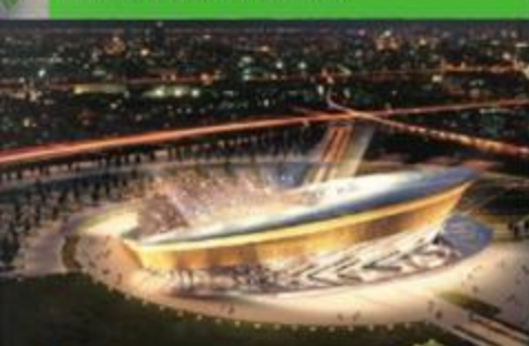
FIFA WORLD CUP™ STADIUM MOSCOW REGION