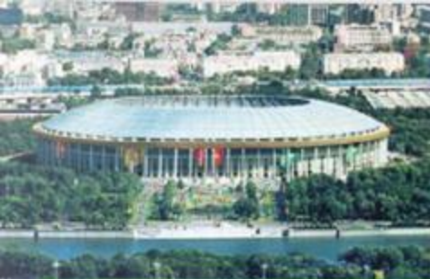
LUZHNIKI STADIUM // MOSCOW