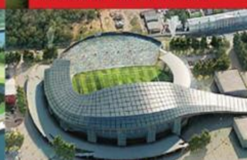
FIFA WORLD CUP™ STADIUM YAROSLAVL