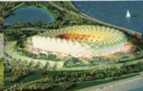
FIFA WORLD CUP™ STADIUM KRASNODAR