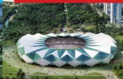
FIFA WORLD CUP™ STADIUM VOLGOGRAD