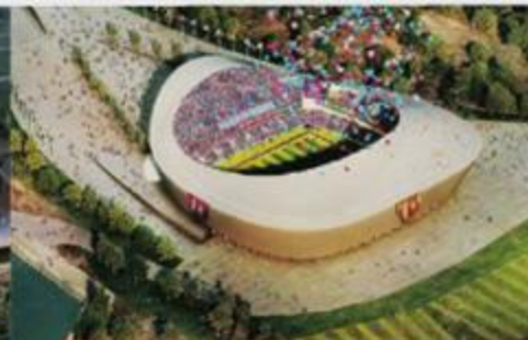
FIFA WORLD CUP™ STADIUM SAMARA