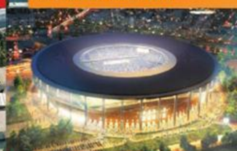
FIFA WORLD CUP™ STADIUM YEKATERINBURG