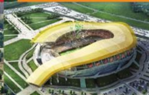
FIFA WORLD CUP™ STADIUM ROSTOV-ON-DON