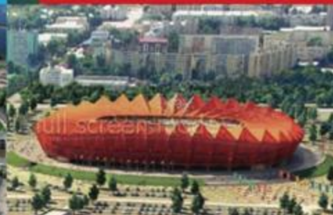
FIFA WORLD CUP™ STADIUM SARANSK