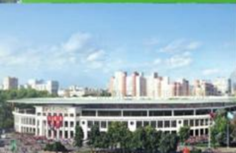
DYNAMO STADIUM // MOSCOW