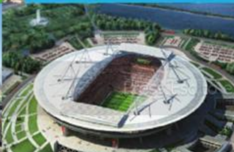
FIFA WORLD CUP™ STADIUM SAINT PETERSBURG