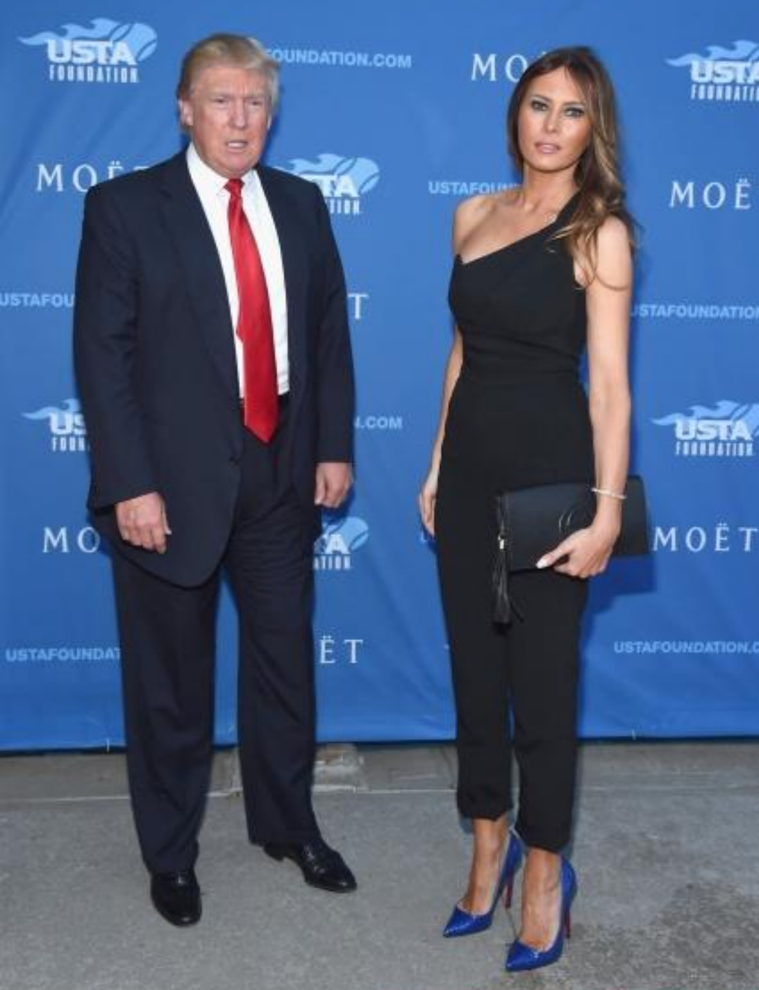
At the 14th Annual USTA Opening. August 25, 2014