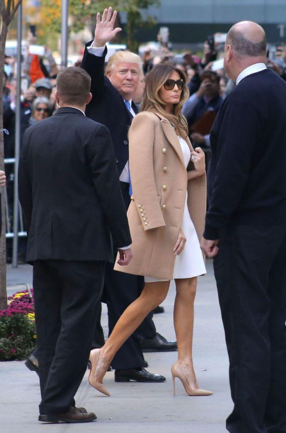
Melania Trump in a camel Balmain coat and a white Michael Kors jacquard dress as she arrives to vote at the polls, in November 2016