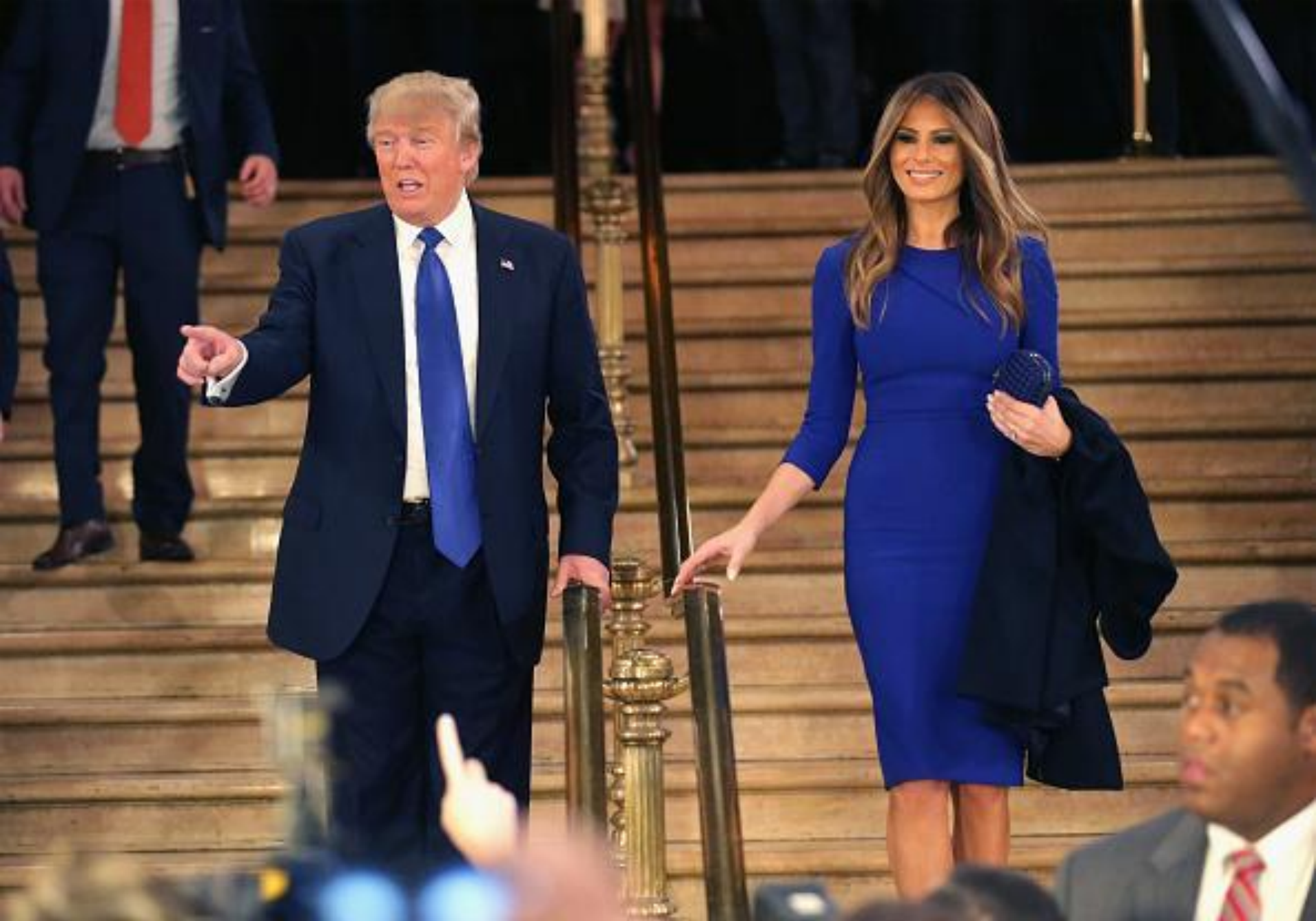
Attending a Fox News-hosted Republican debate. March 3, 2016.