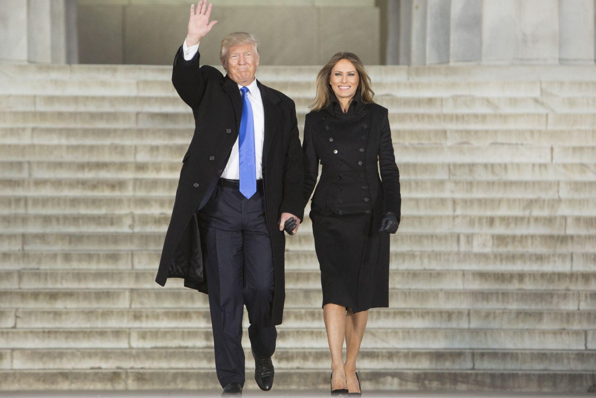
Melania in a cashmere military coat by NYC designer Norisol Ferrari for a visit to Arlington Cemetery, on January 19, 2017