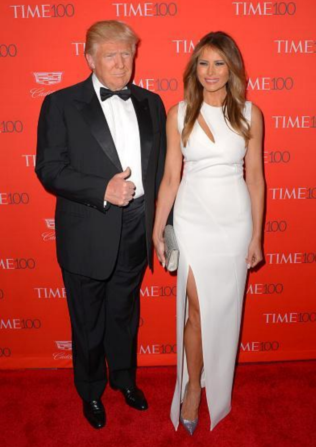
At the Time 100 Gala. Dress by Mugler. April 26, 2016