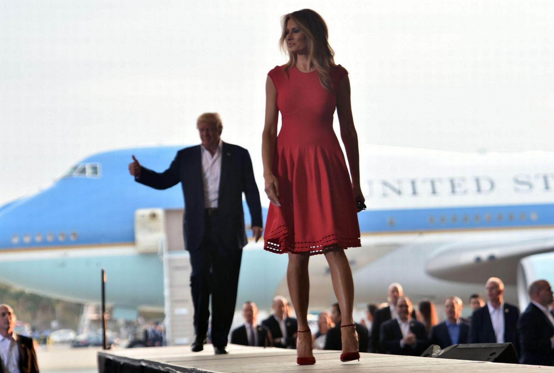
A red Alexander McQueen dress as the Trumps arrive for a rally in Florida, on February 18, 2017