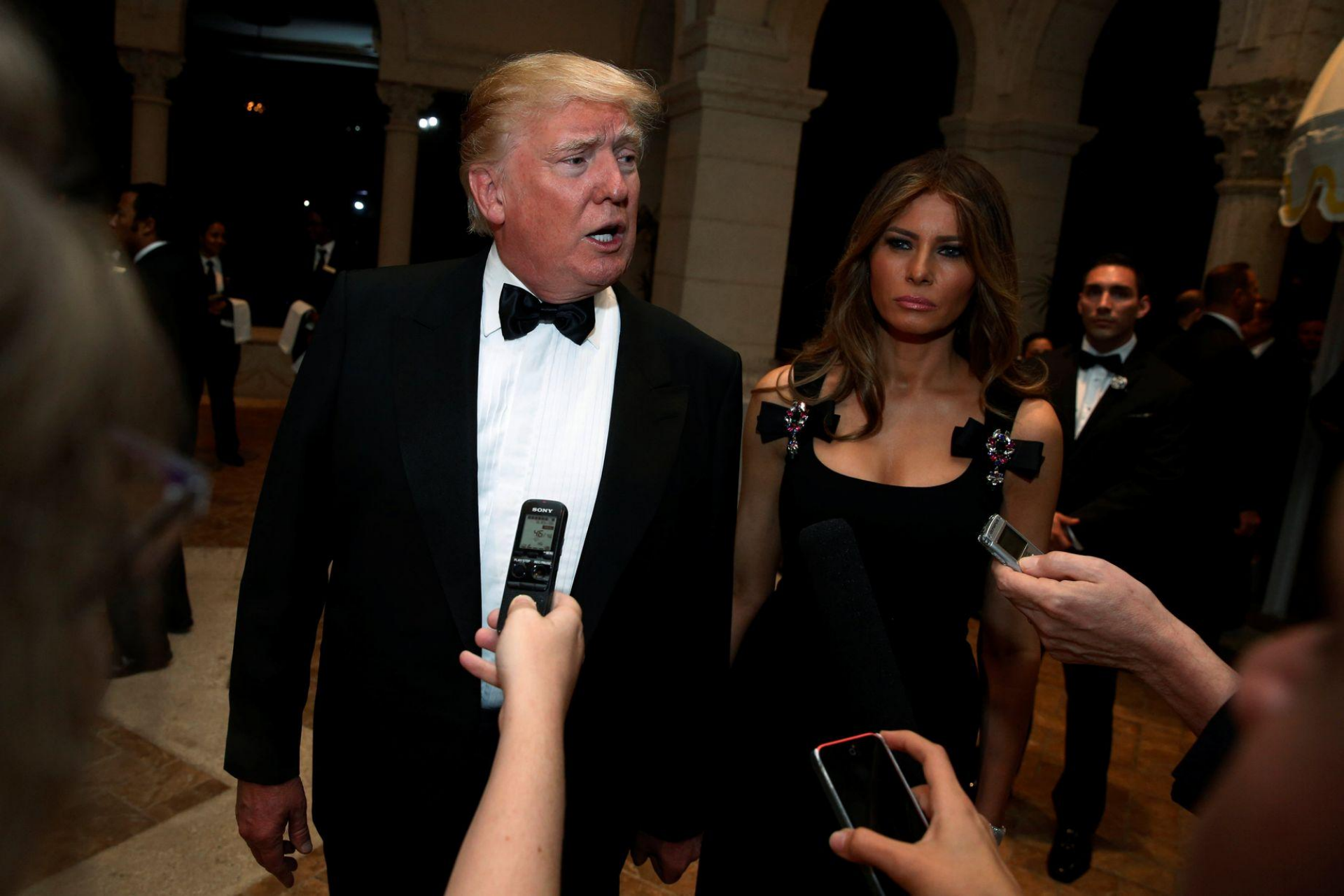
Melania in a Dolce & Gabbana LBD on New Years Eve