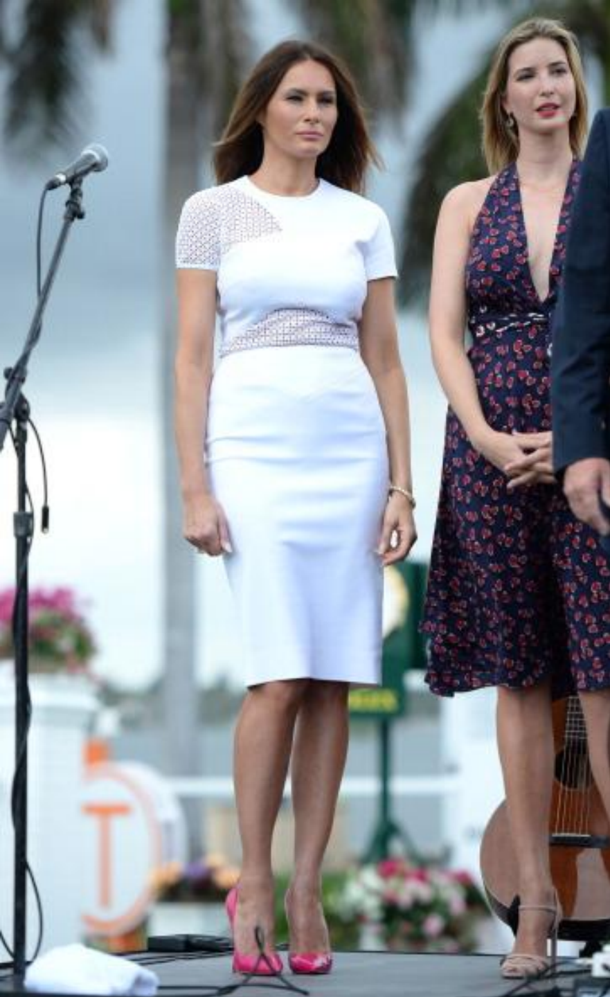
At the Trump Invitational Grand Prix in Palm Beach, Florida. January 6, 2014