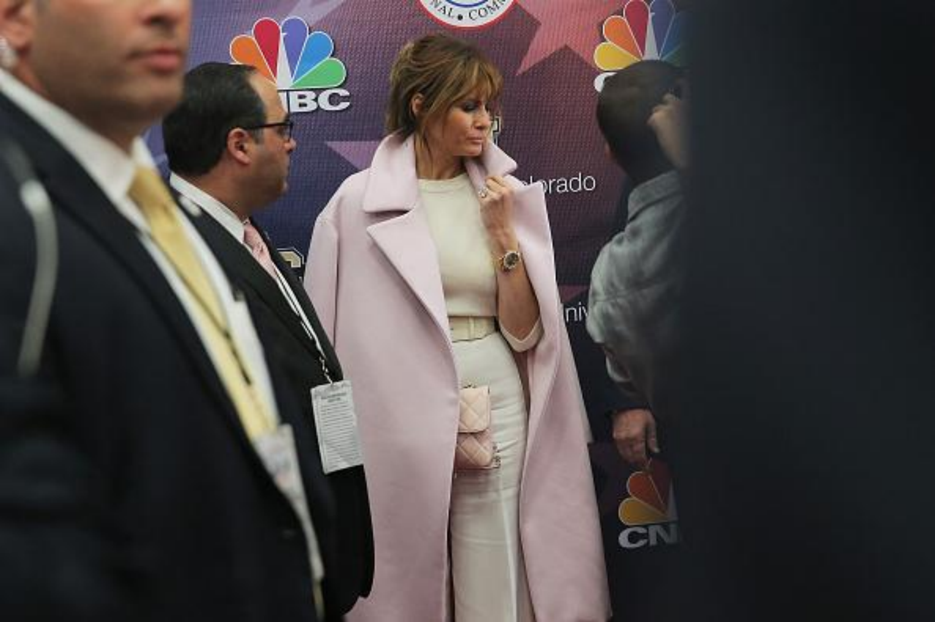
At the 3rd Republican presidential debate in Boulder, Colorado. October 28, 2015