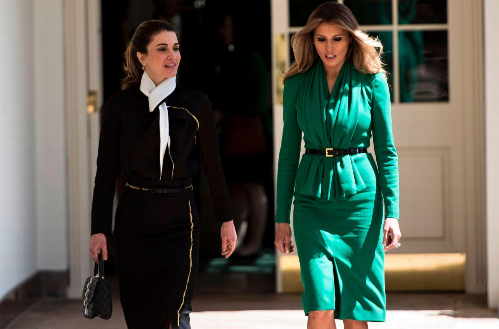
Wearing a belted emerald green Hervé Pierre dress to meet Jordan's Queen Rania, on April 5, 2017