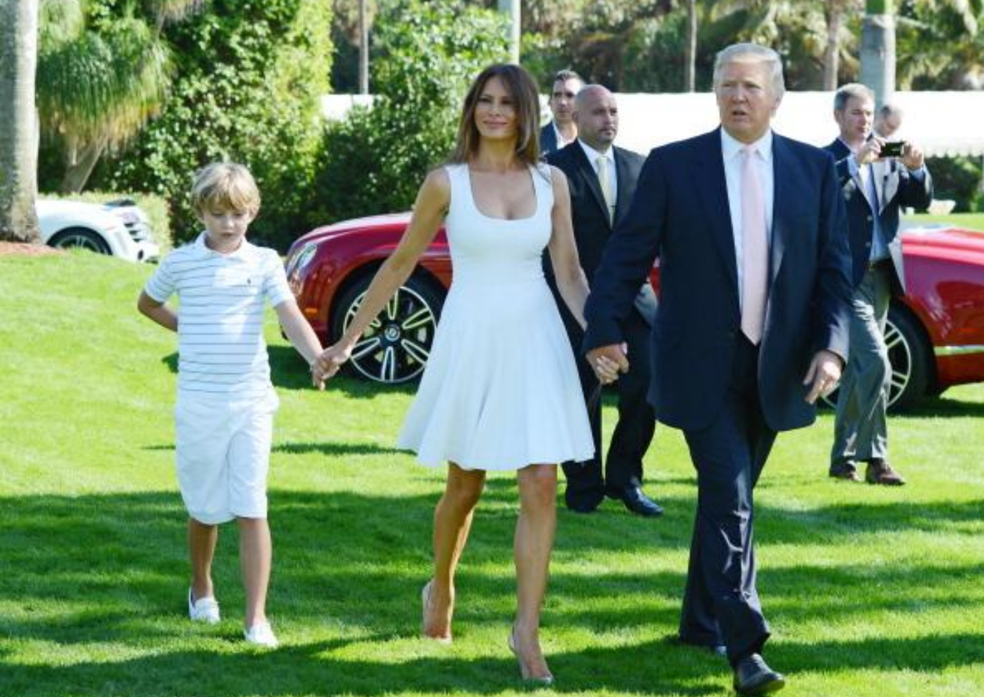
At an event at Mar-A-Lago in Florida. January 6, 2016