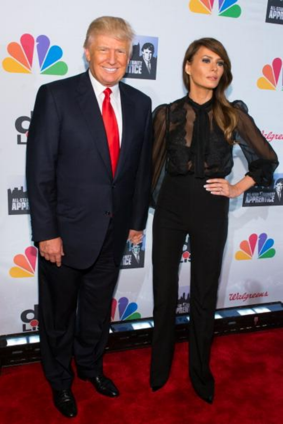
At a Celebrity Apprentice event in New York. May 19, 2013