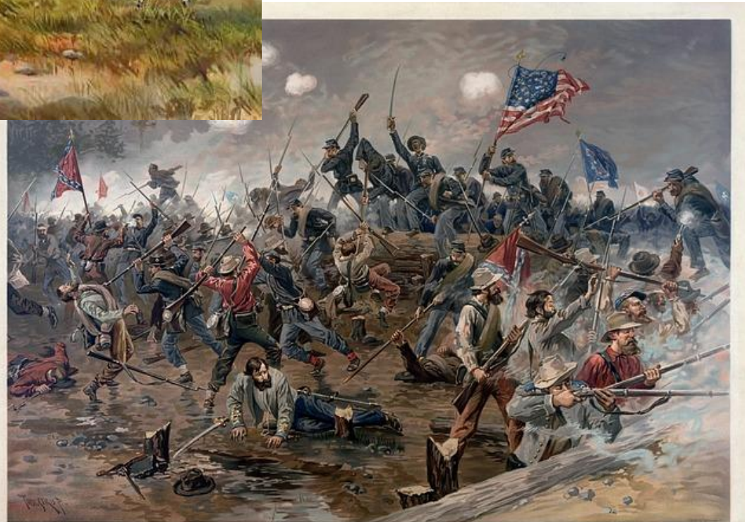
BATTLE OF SPOTTSYLVANIA.