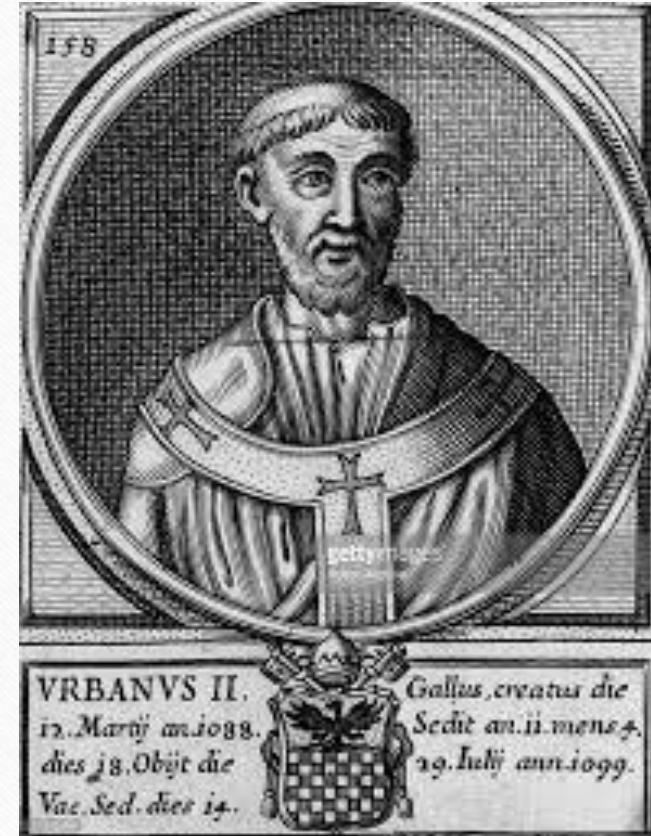
Pope Urban II