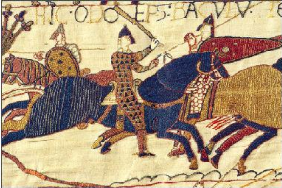
Odo, Bishop of Bayeux, from the Bayeux Tapestry

Odo of Bayeux, William's uncle, led a baronial rebellion in Normandy and was crushed.