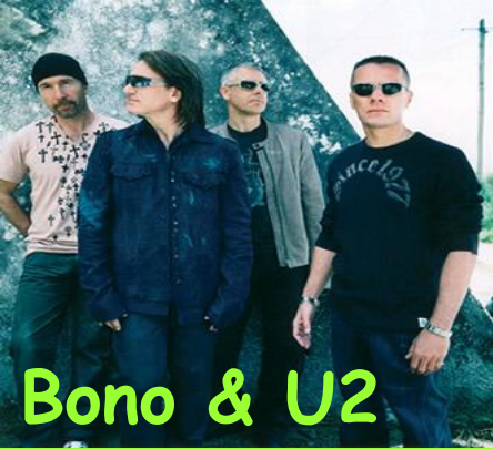
Bono & U2