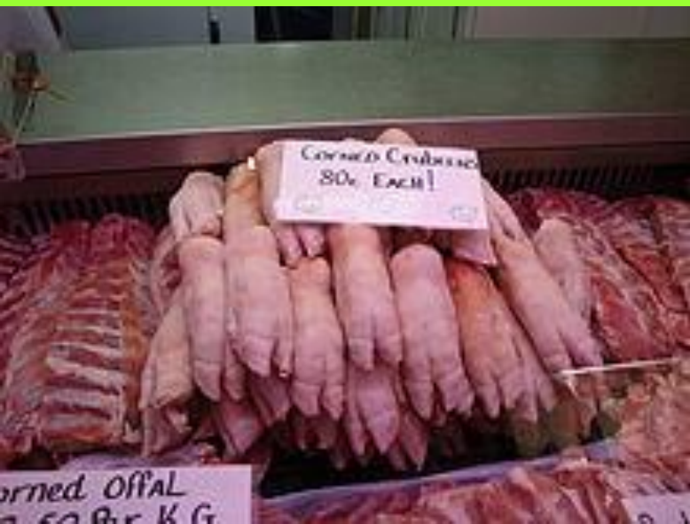
Crubeens are made of boiled pigs' feet