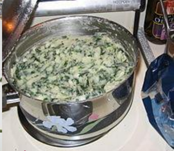
Colcannon, an Irish potato and kale dish