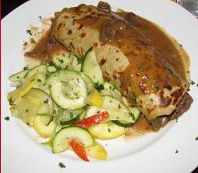
Boxty, a potato pancake