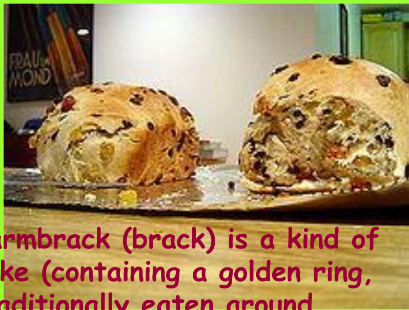
Barmbrack (brack) is a kind of cake (containing a golden ring, traditionally eaten around Halloween).