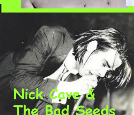
Nick Cave & The Bad Seeds