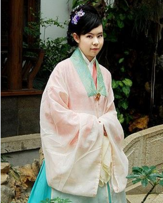
"Traditional clothing (hanfu)" by [Supersentai] is licensed under CC by 3.0

Hanfu is the name for traditional Chinese clothing that dates from ancient China up to around AD 1600.