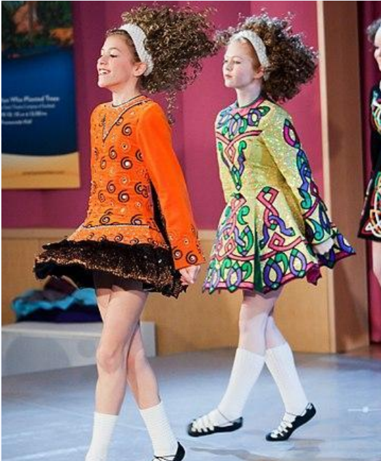
"Trinity Academy of Irish Dance" by [John Benson] is licensed under CC by 2.0

In Ireland, step dancing is very popular. Step dancing costumes are worn by the dancers, usually made from materials such as silk and velvet. They are brightly decorated with materials, such as sequins, lace and embroidery.