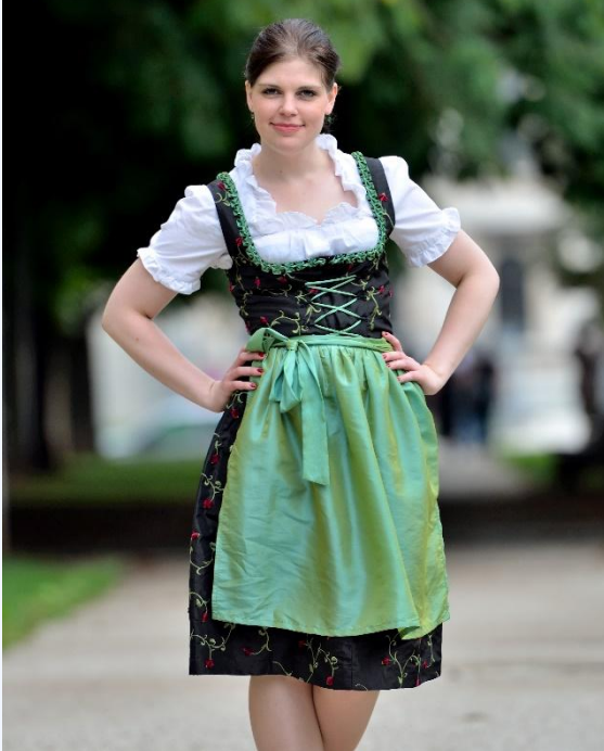
"Dirndl with lacing and green apron" by [Nemoralis] is licensed under CC by 2.0

A dirndl is a traditional Austrian dress made up of a pinafore dress, blouse with short puffed sleeves and an apron. It is usually made of light materials, such as cotton or linen for the summer version and thicker materials, such as wool for the winter.