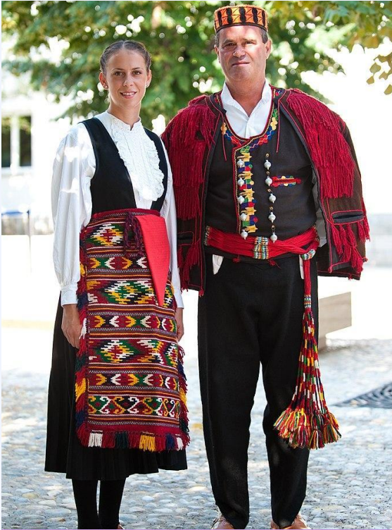
“Hrvatski” by [Roberta F.] is licensed under CC by 3.0

In Croatia, traditional folk dresses for women are often a plain white blouse or dress covered in a decorative jacket and overskirt. For men, traditional outfits are usually wide trousers and shirt (both black or white) and a decorative waistcoat and cap.