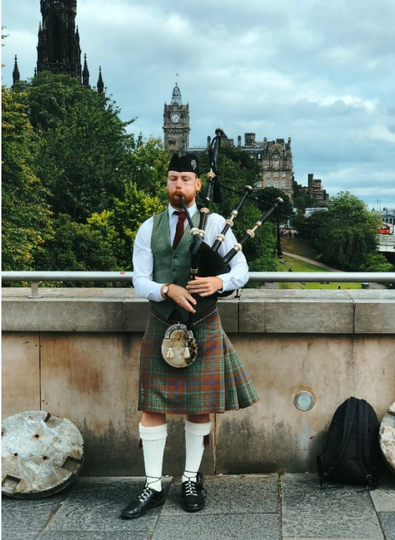
"Kilt" by [Jon Tyson] is licensed under CC by 2.0

A kilt is traditional Scottish clothing for men and boys, though may also be worn by women.