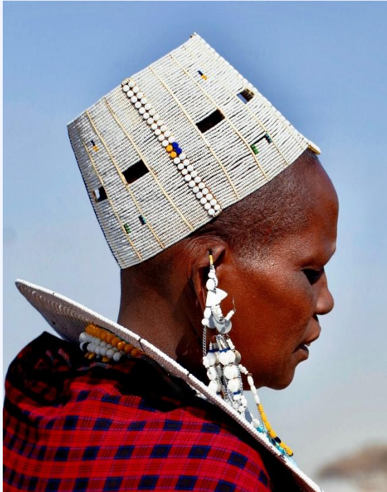
"Maasai Shuka"

Shuka is the Maa word for 'sheets', traditionally worn wrapped around the body. They are usually bright colours, such as red and blue, and are patterned. The fabrics used are strong and thick to protect against the harsh weather and savannah.