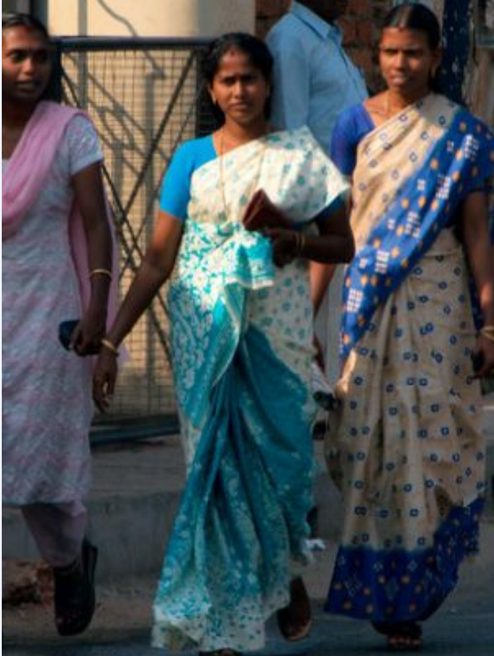
"Indian Women"

The Sari is a type of traditional women's clothing in India.