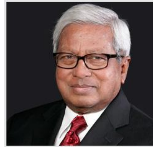
Sir Fazle Hasan Abed KCMG, Founder and Chairperson