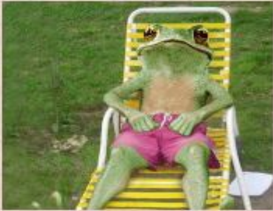
A frog can...