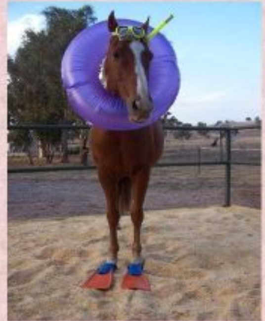
A horse can...