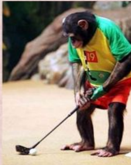
A chimp can...