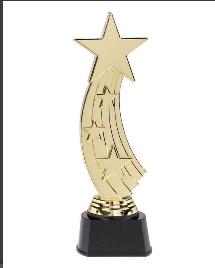
Rising Star Award

Maria Sharapova first competed in November 2000, when she won the Eddie Herr International Junior Tennis Championships for girls aged 16, when Sharapova was only 13 years old at the time, for which she was awarded a special Rising Star Award, which is given to the most promising tennis players.